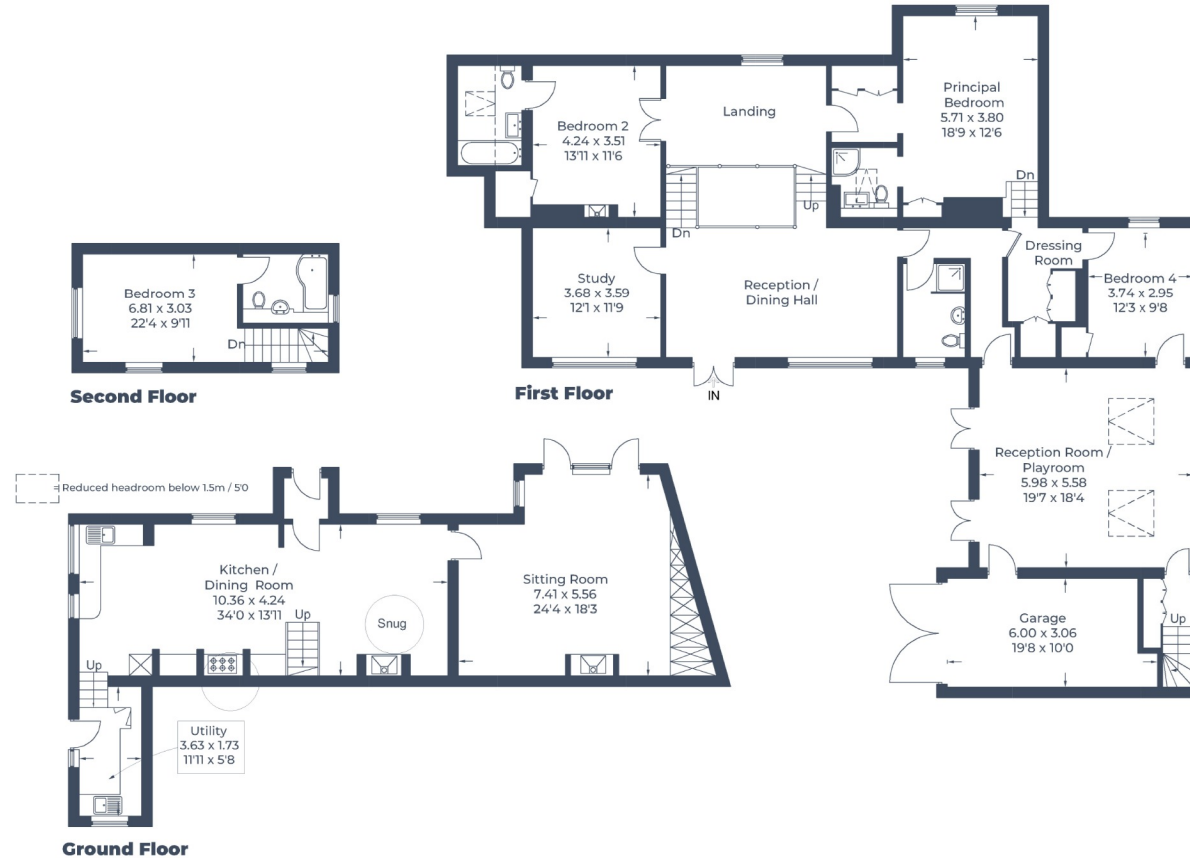
Illustration for identification purposes only, measurements are approximate, not to scale.