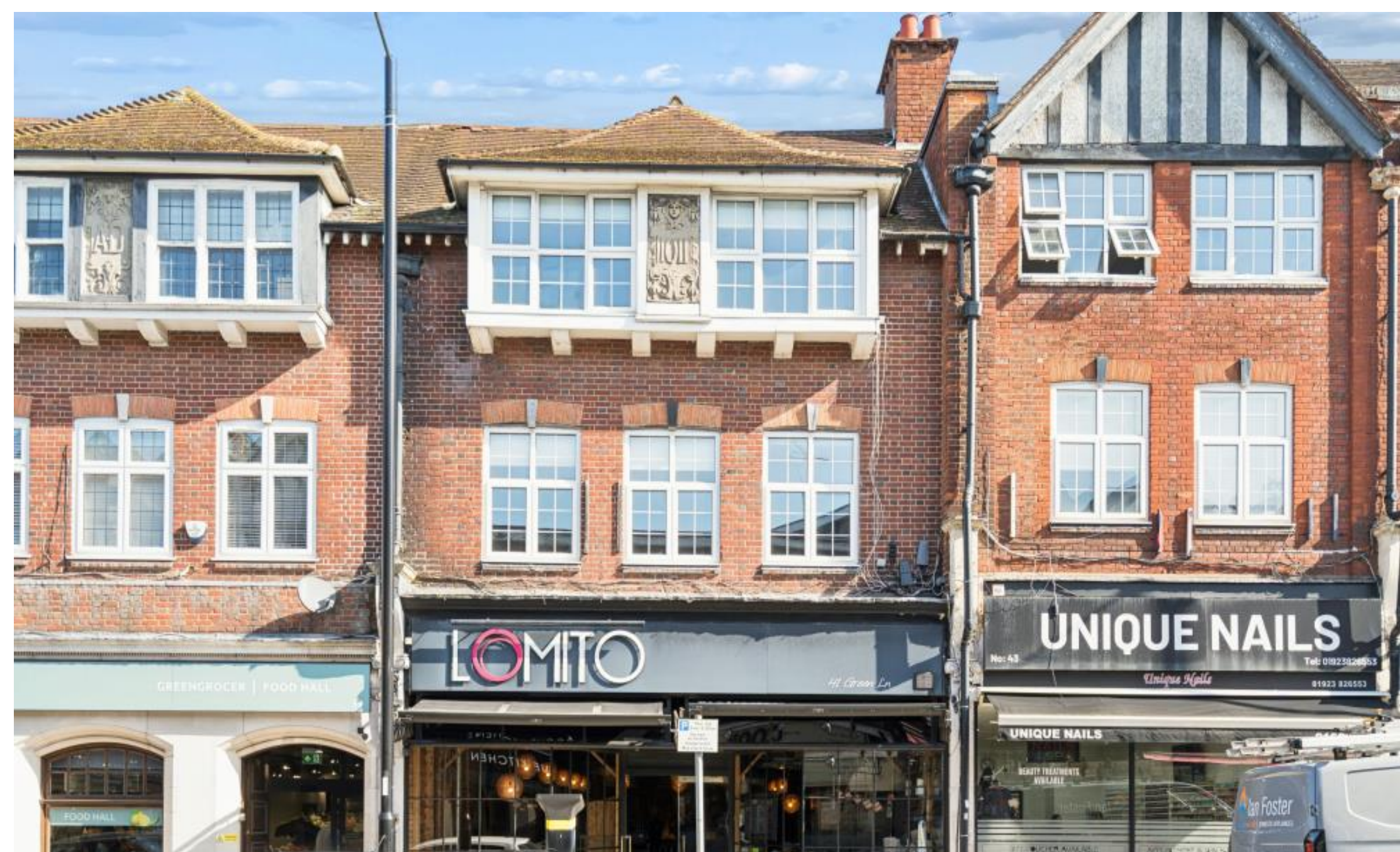
A completely renovated two bedroom town centre apartment Oaklands Gate, Northwood, HA6 3AA