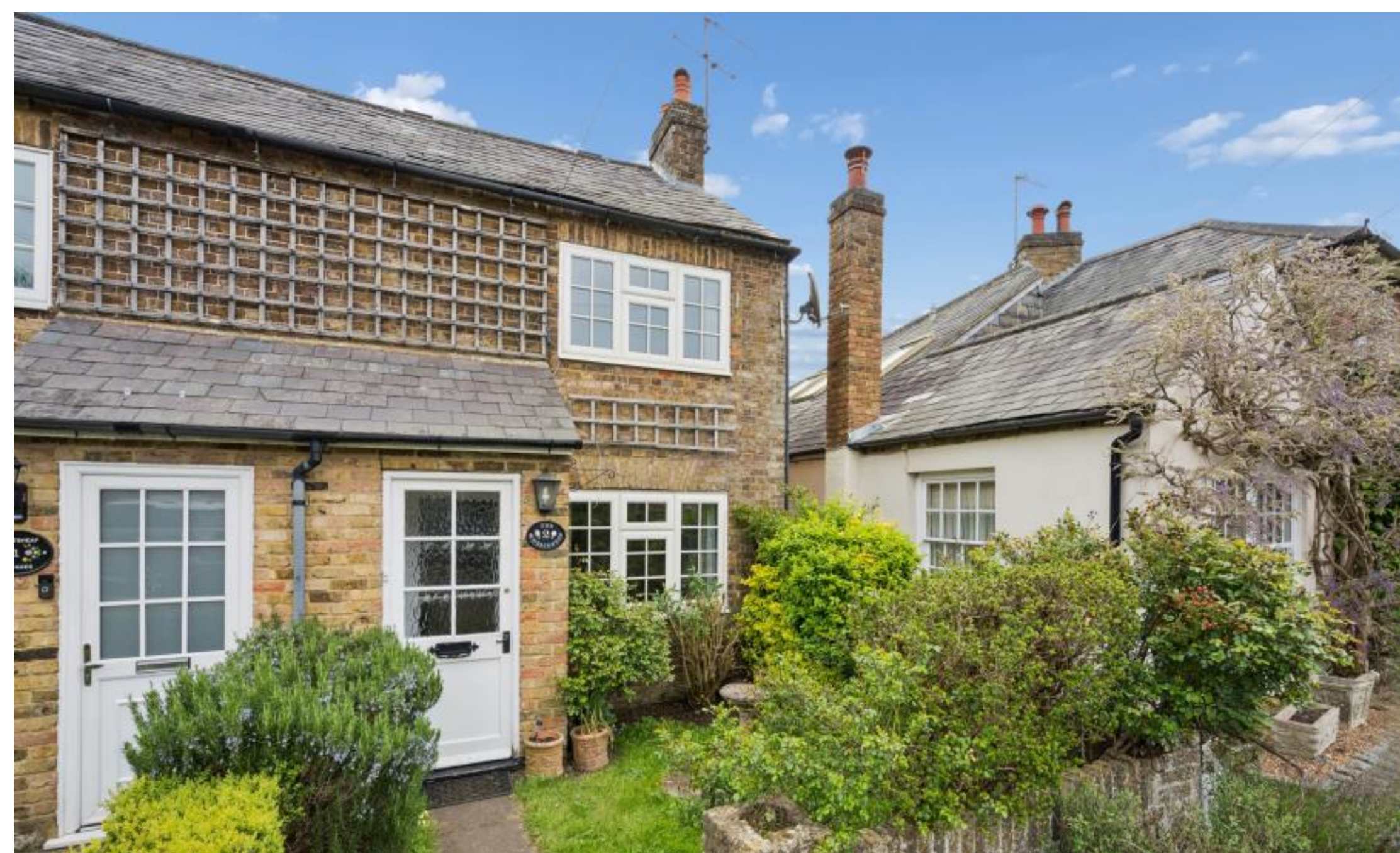
A charming two bedroom cottage in the heart of the village The Green, Sarratt, WD3 6BR