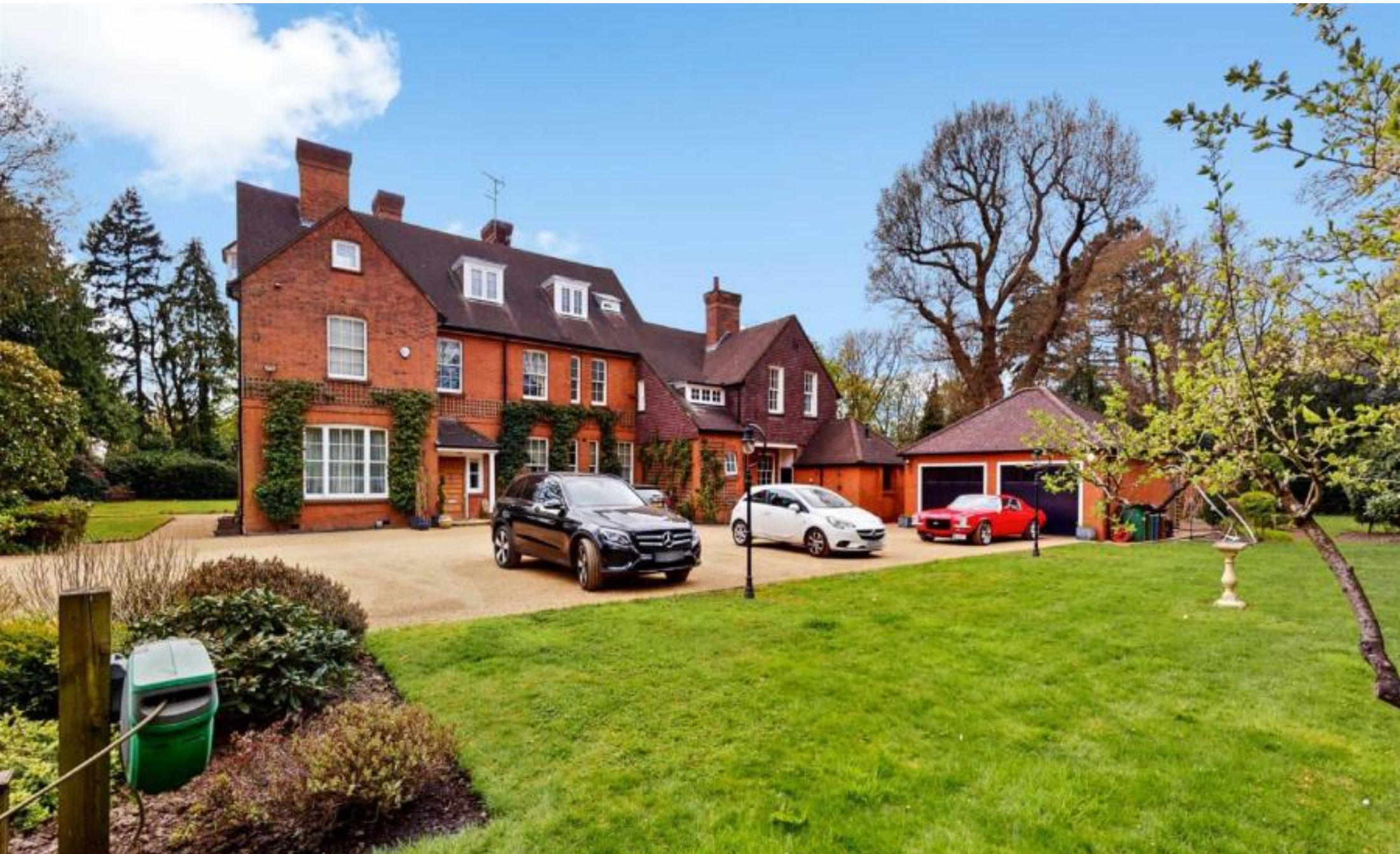
A magnificent seven bedroom resident on the private Mount Park Estate Mount Park Road, Harrow On The Hill, HA1 3JR