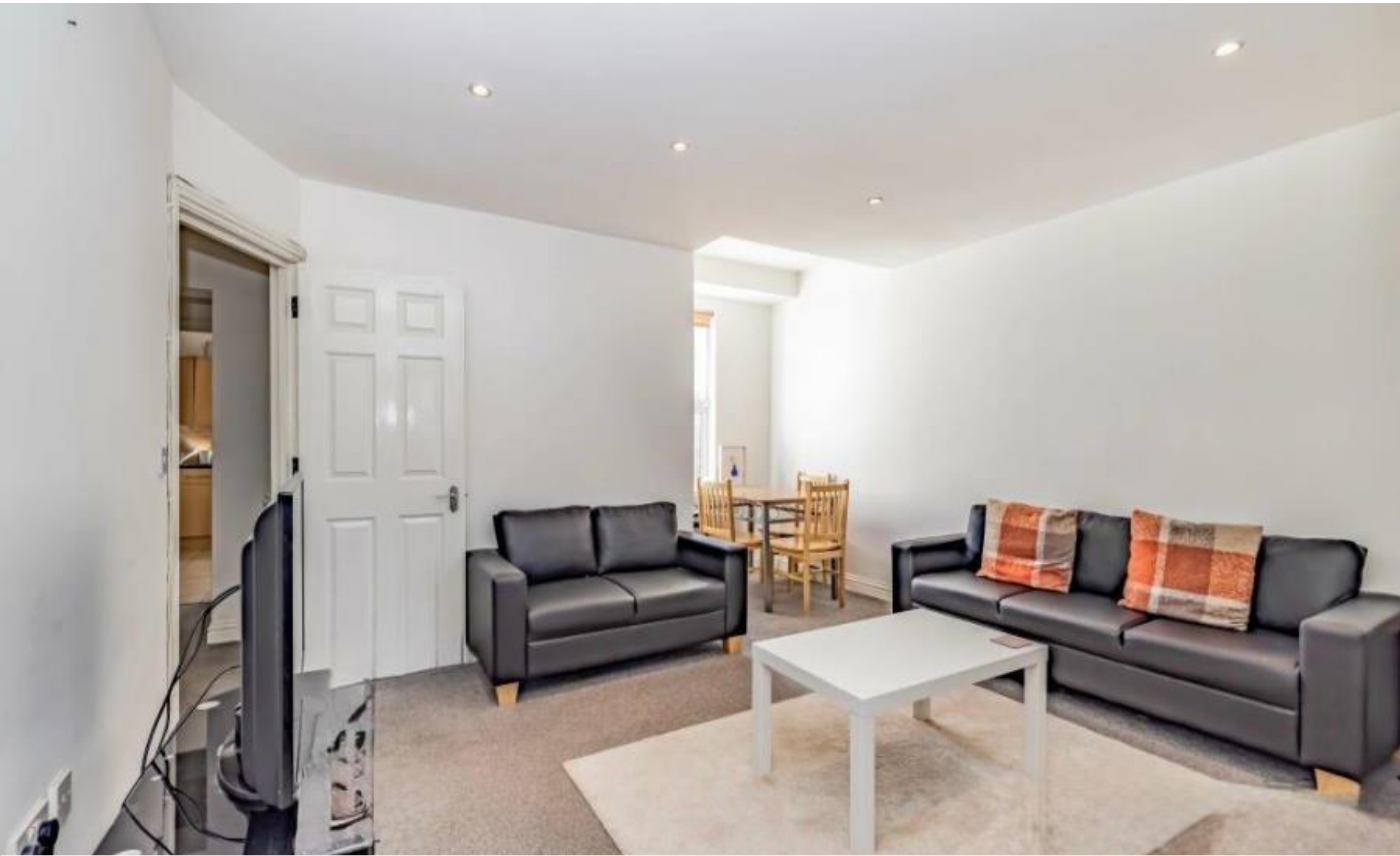
A three bedroom duplex apartment in a central location High Street, Northwood, HA6 1BN