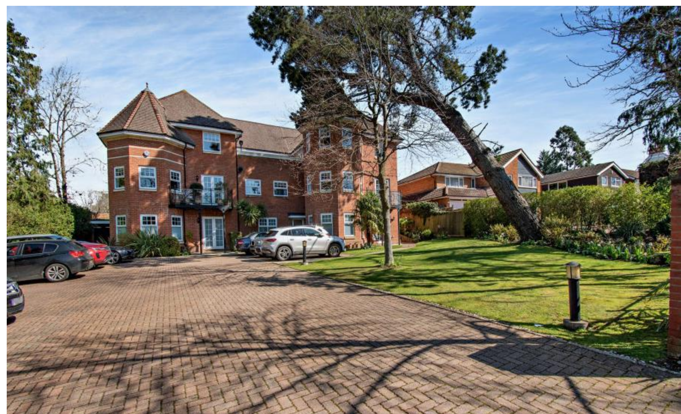
A three bedroom apartment with private patio area Frithwood Avenue, Northwood, HA6 3LY