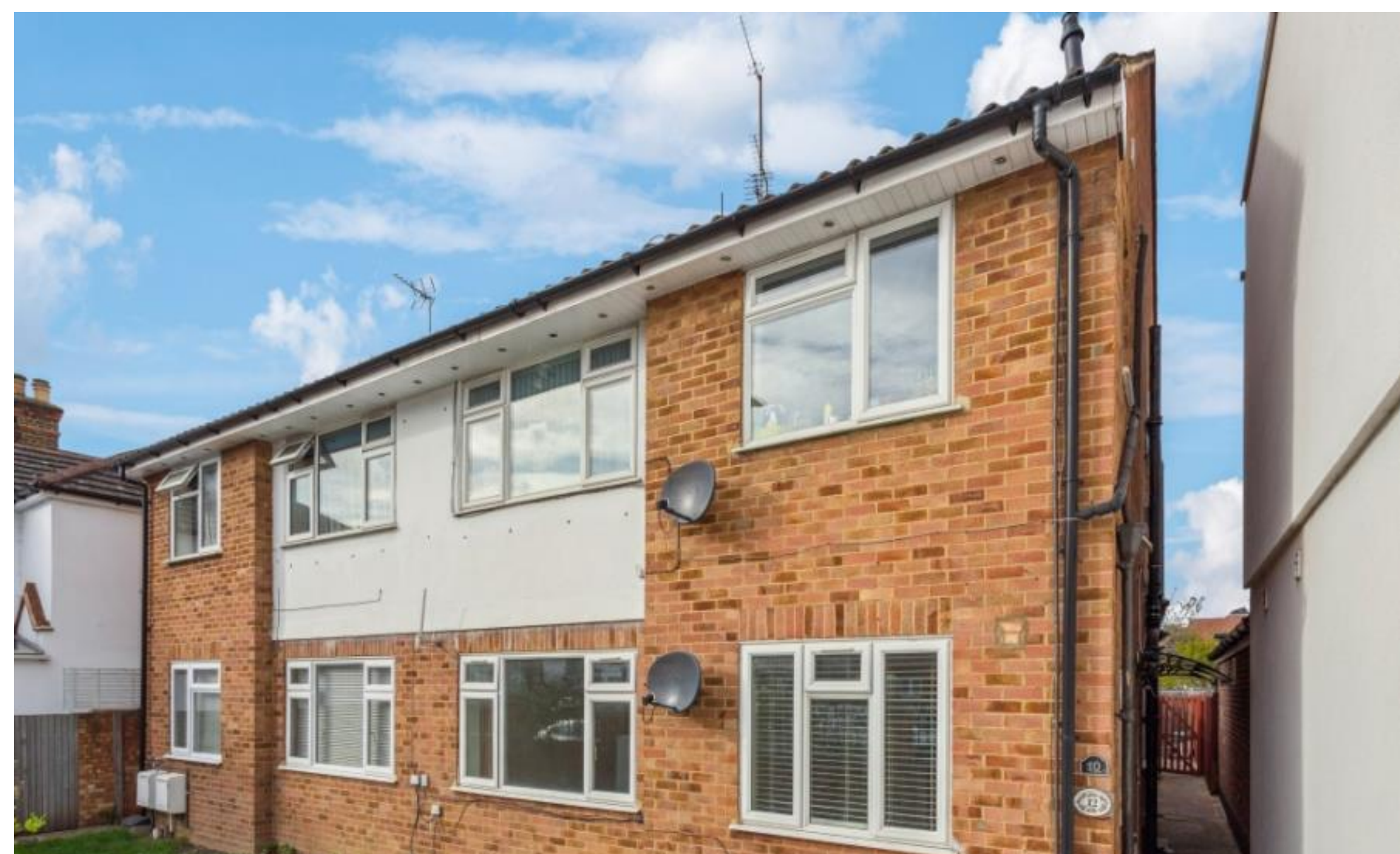
A two bedroom, two bathroom maisonette with private garden Pinner Green, Pinner, Middlesex HA5 2AA