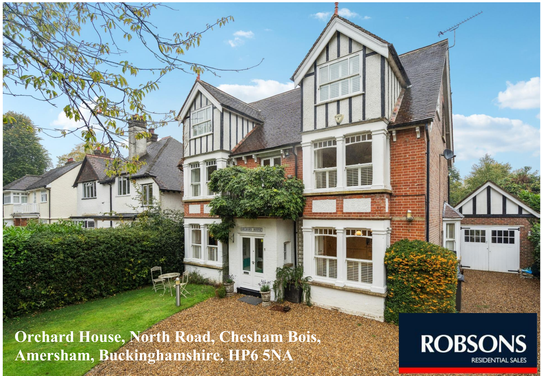
Orchard House, North Road, Chesham Bois, Amersham, Buckinghamshire, HP6 5NA