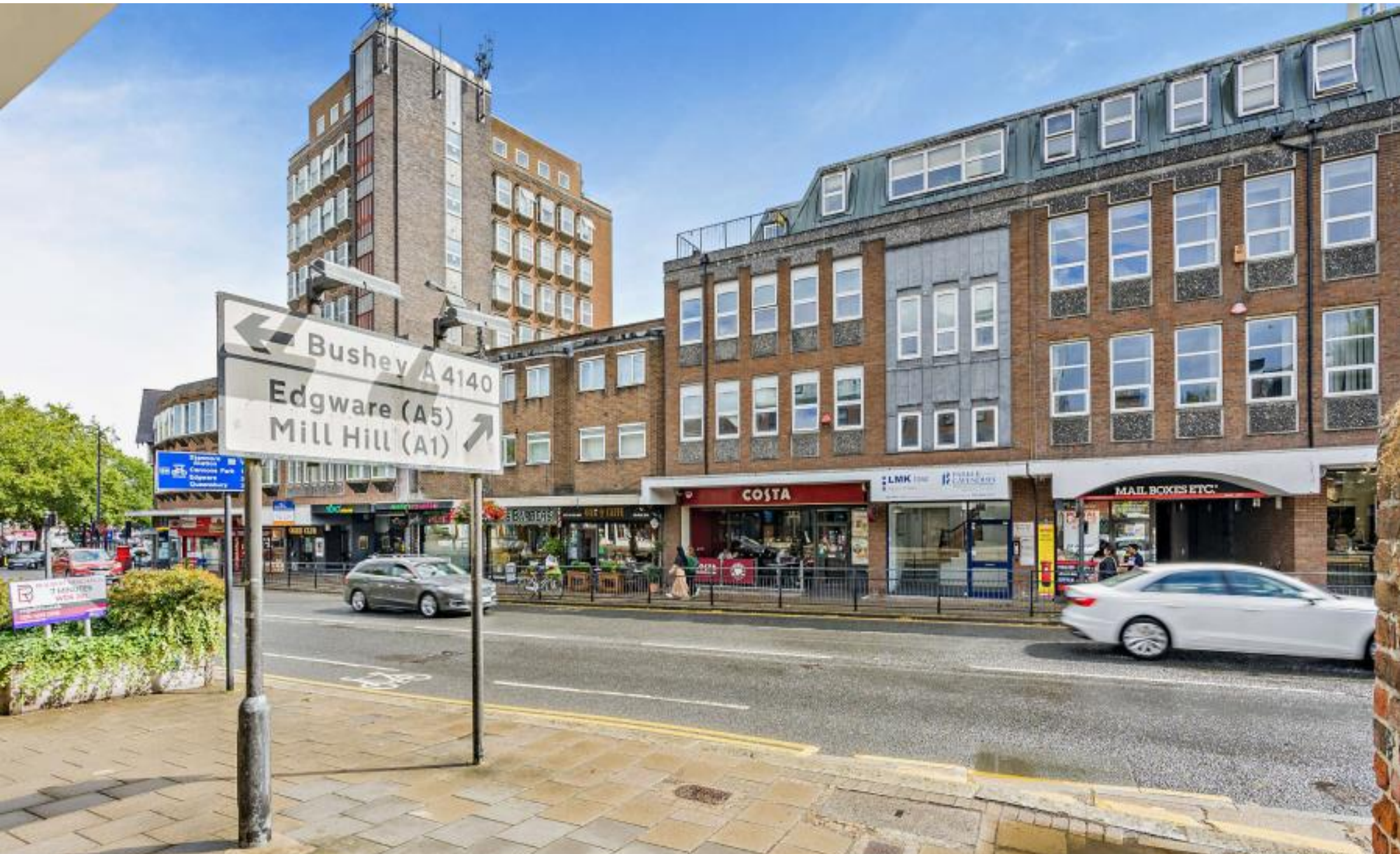
A one bedroom apartment with a private balcony with views Kasaka House, Stanmore, HA7 4AW