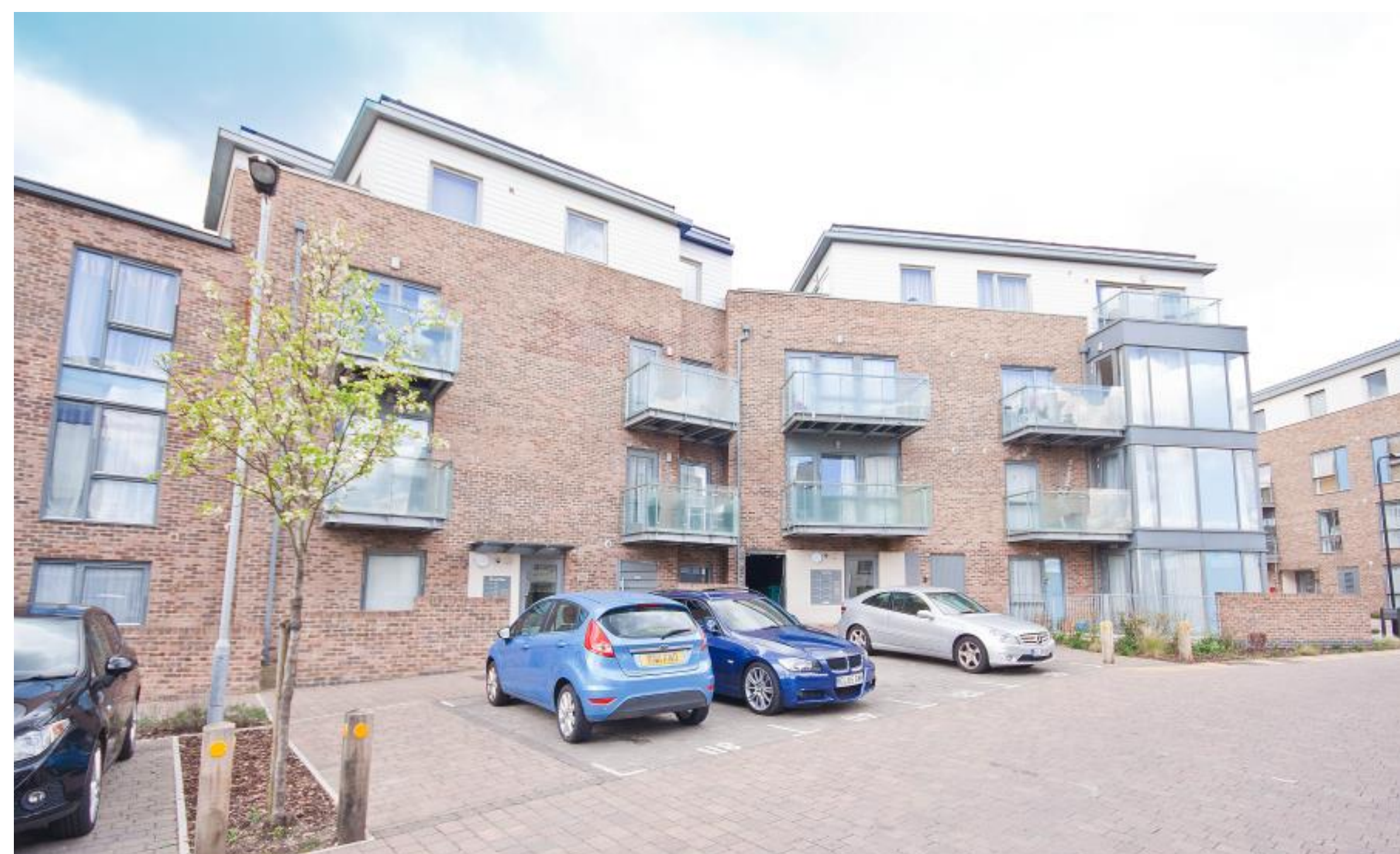
A two bedroom, two bathroom flat with a private balcony 2 Lily Close, Pinner, HA5 3JT