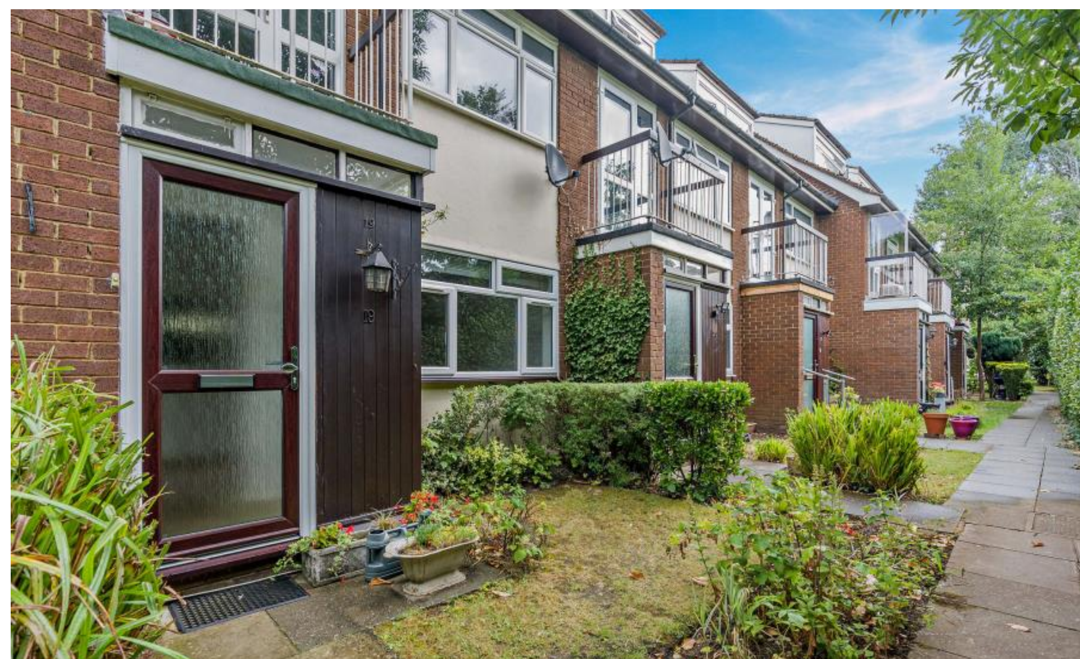
A one bedroom ground floor maisonette close to local amenities Claire Court,, HA5 4LB