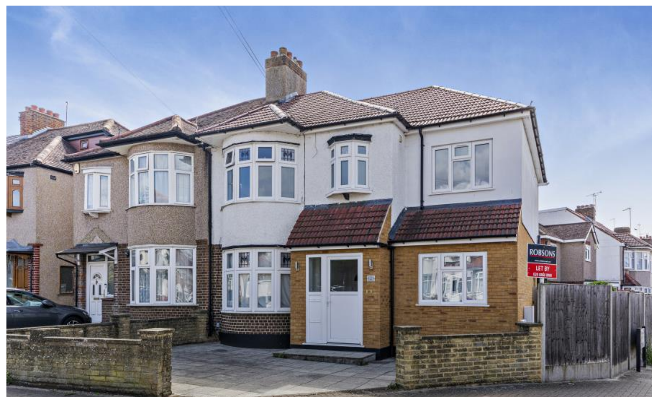
A well presented ground floor two bedroom maisonette with private garden 121 Blenheim Road, Harrow, HA2 7AA