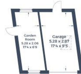
Outbuilding (Not Shown in Actual Location / Orientation)

This plan is for layout guidance only. Not drawn to scale unless stated. Windows and door openings are approximate. Whilst every care is taken in the preparation of this plan, please check all dimensions, shapes and compass bearings before making any decisions reliant upon them.