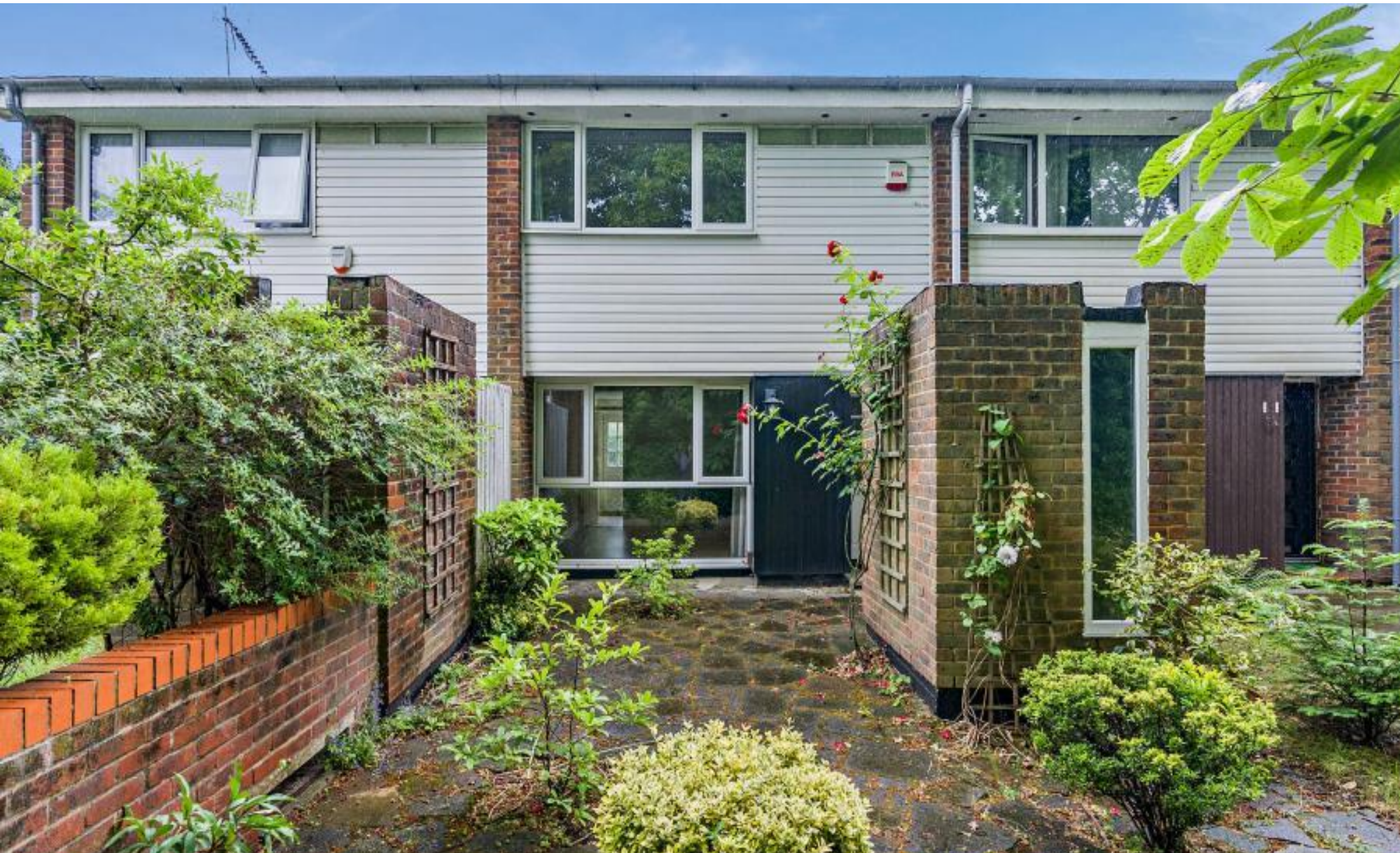
A two bedroom terraced house in a cul de sac location Hawkesworth Close, Northwood, HA6 2FT