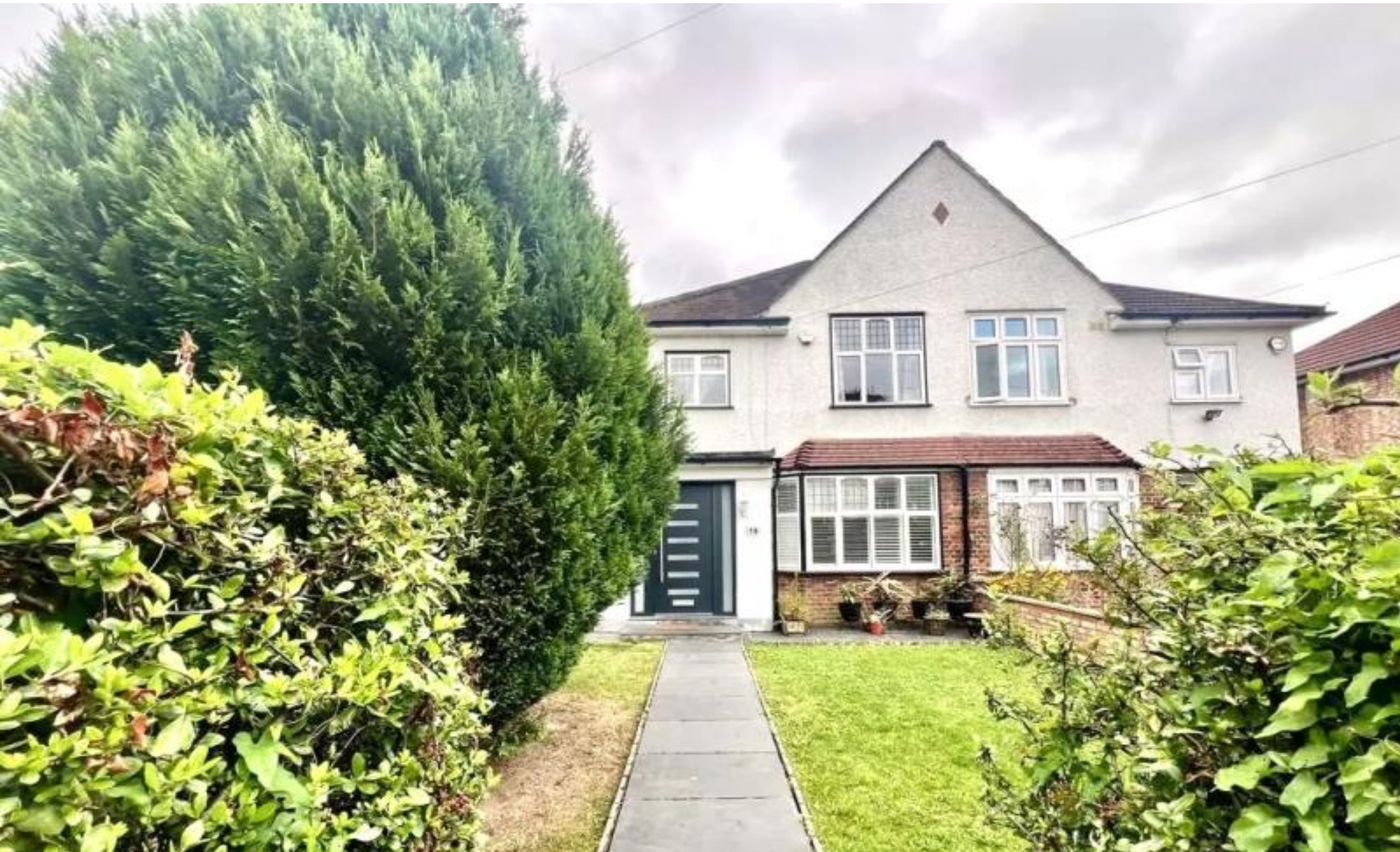
A three bedroom family home in an ideal location for local amenities Lyncroft Avenue, Pinner, HA5 1JU