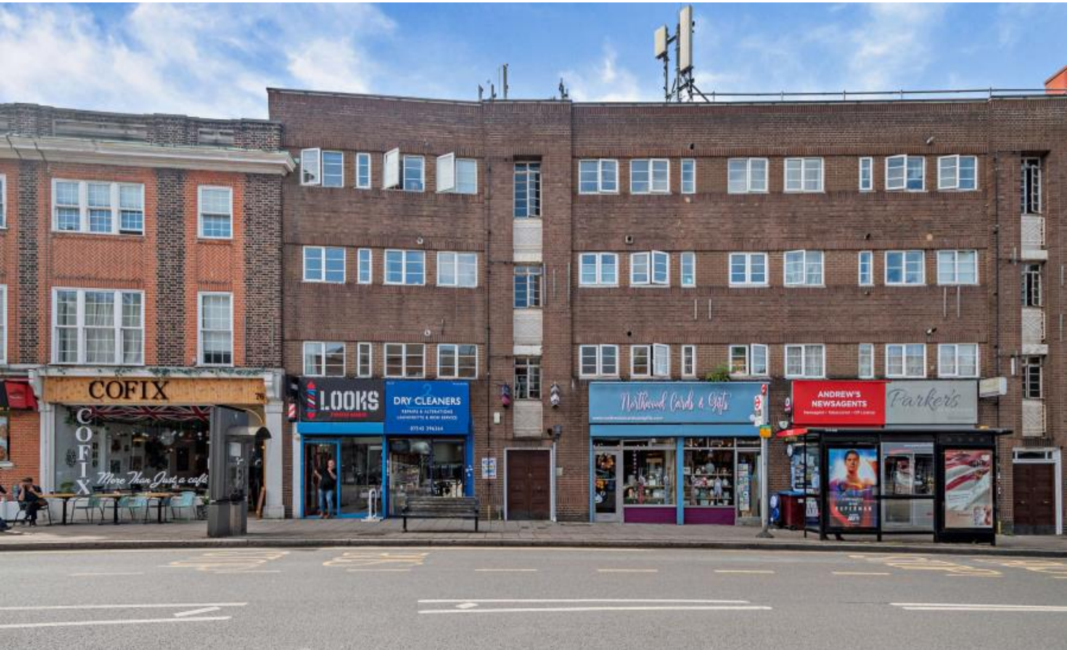
Beautifully Renovated Two-Bedroom Apartment located close to amenities Chester Place, Northwood, HA6 2XX