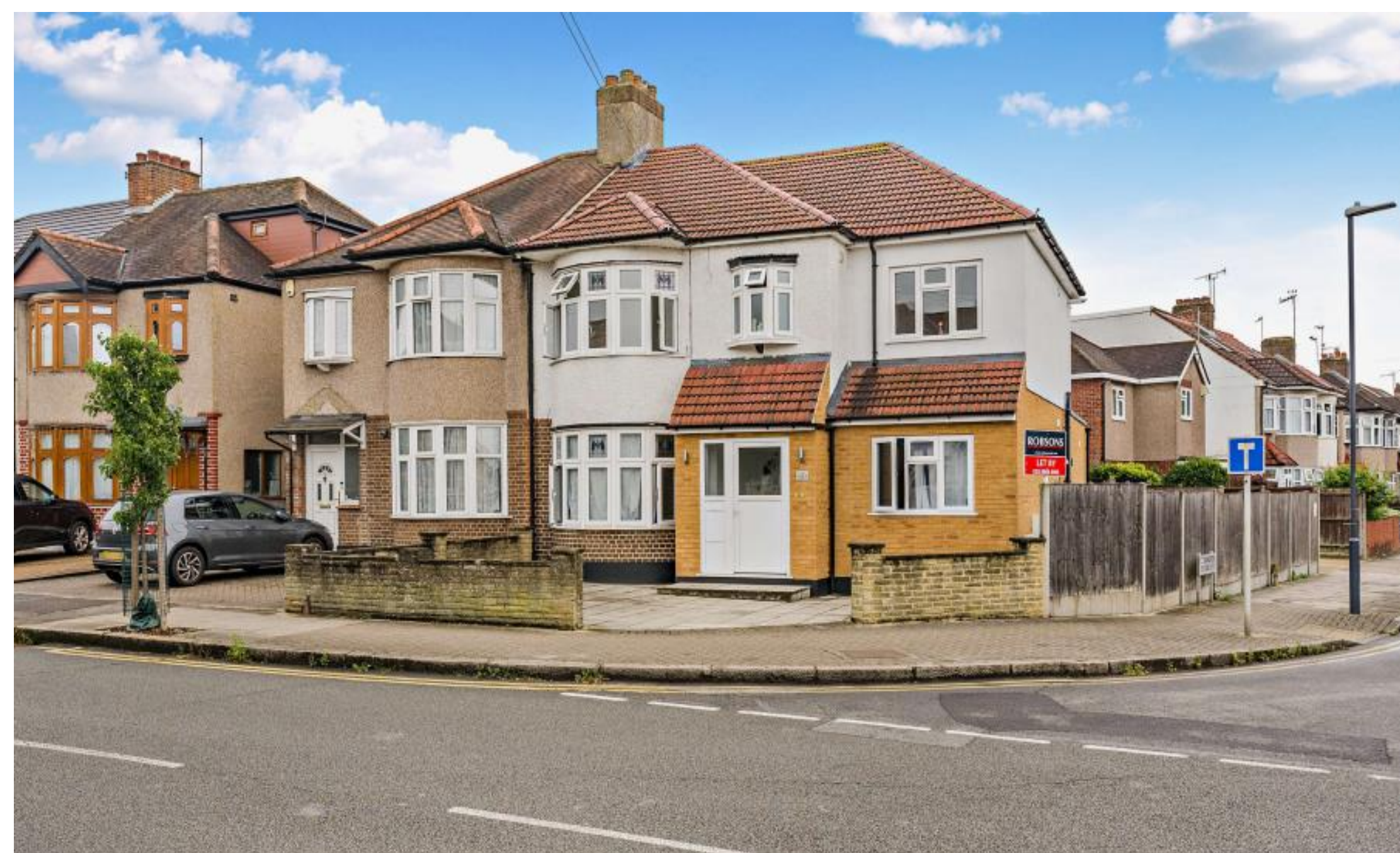
A well presented ground floor two bedroom maisonette with private garden 121 Blenheim Road, Harrow, HA2 7AA