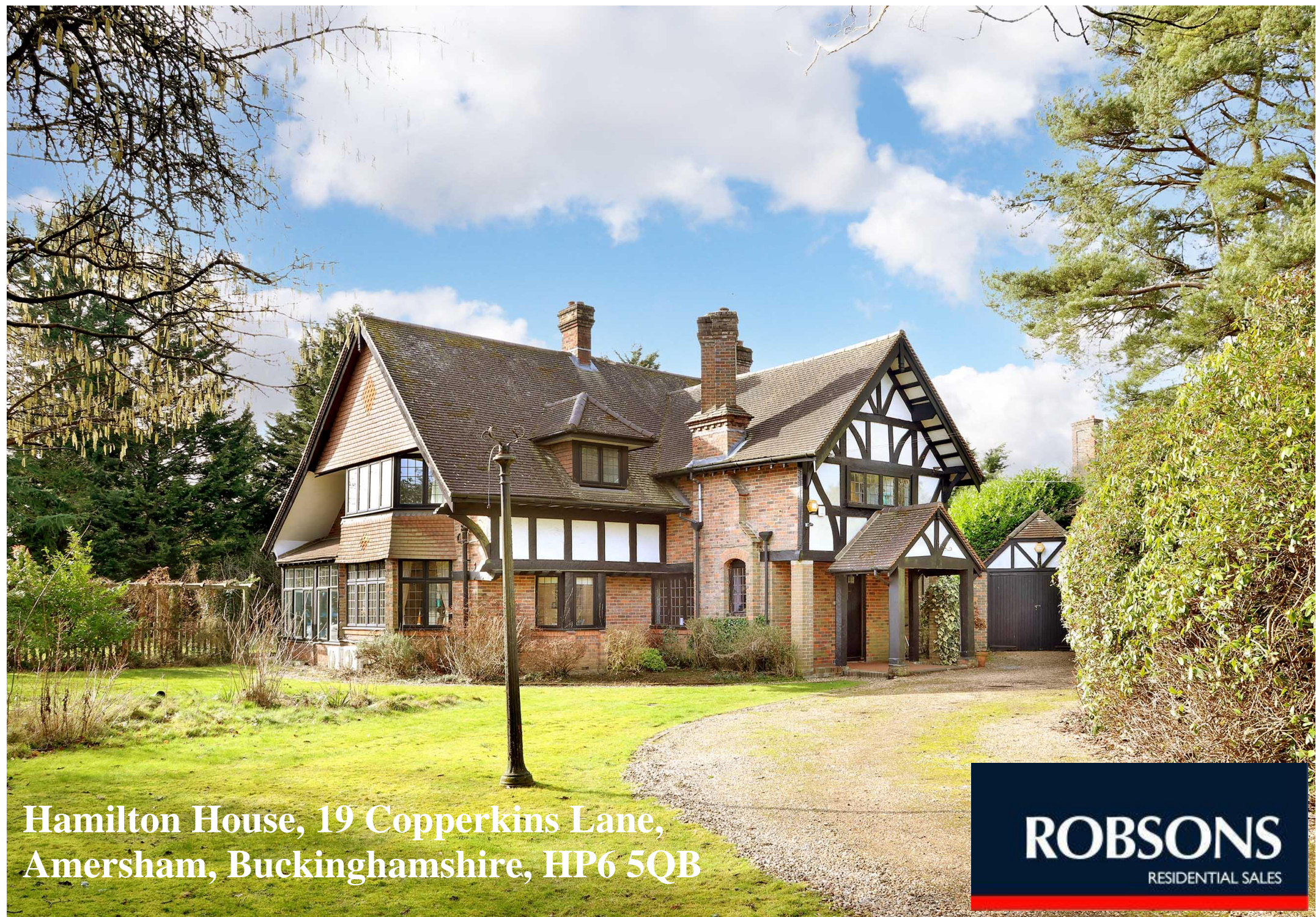
Hamilton House, 19 Copperkins Lane, Amersham, Buckinghamshire, HP6 5QB