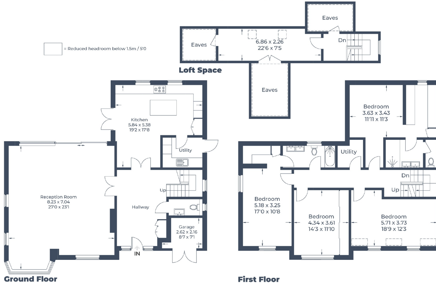
Illustration for identification purposes only, measurements are approximate, not to scale. © CJ Property Marketing Produced for Robsons