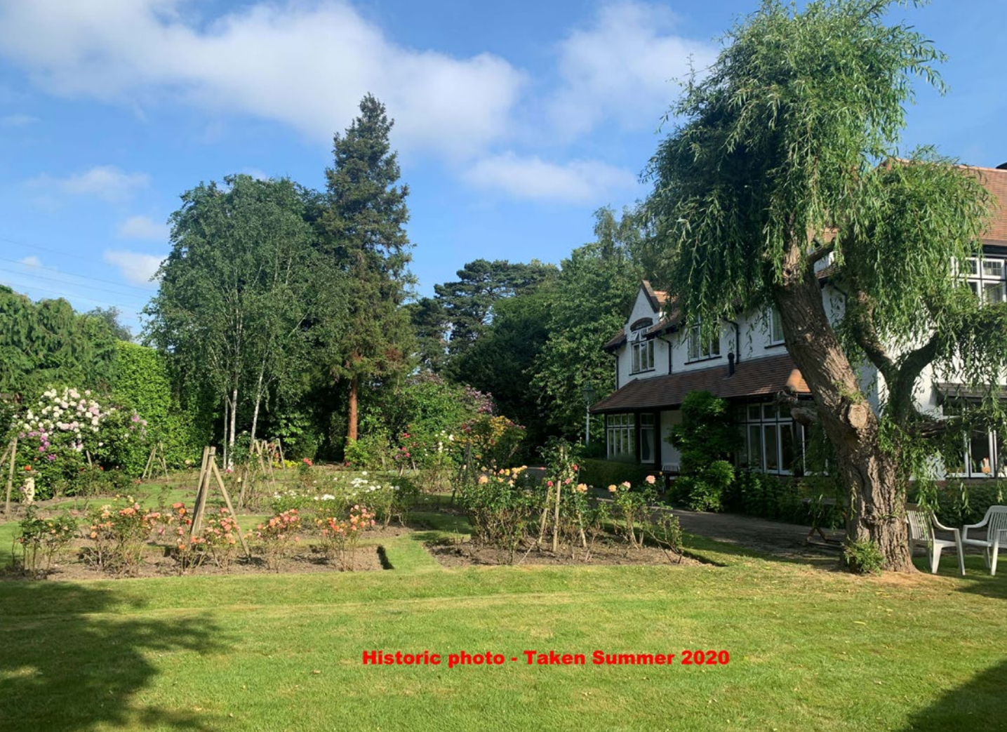
Historic photo - Taken Summer 2020

The ground floor comprises a large reception hall allowing access to a spacious lounge featuring an Adam-style fireplace, a guest cloakroom with ample storage space, and a generously-sized dining room that overlooks the flood-lit garden pond. Completing the ground floor is a south-facing kitchen / breakfast room that is flooded with natural light, and has the potential to be extended. To the first floor there are four large double bedrooms with one benefitting from an en-suite shower room, and a family bathroom.