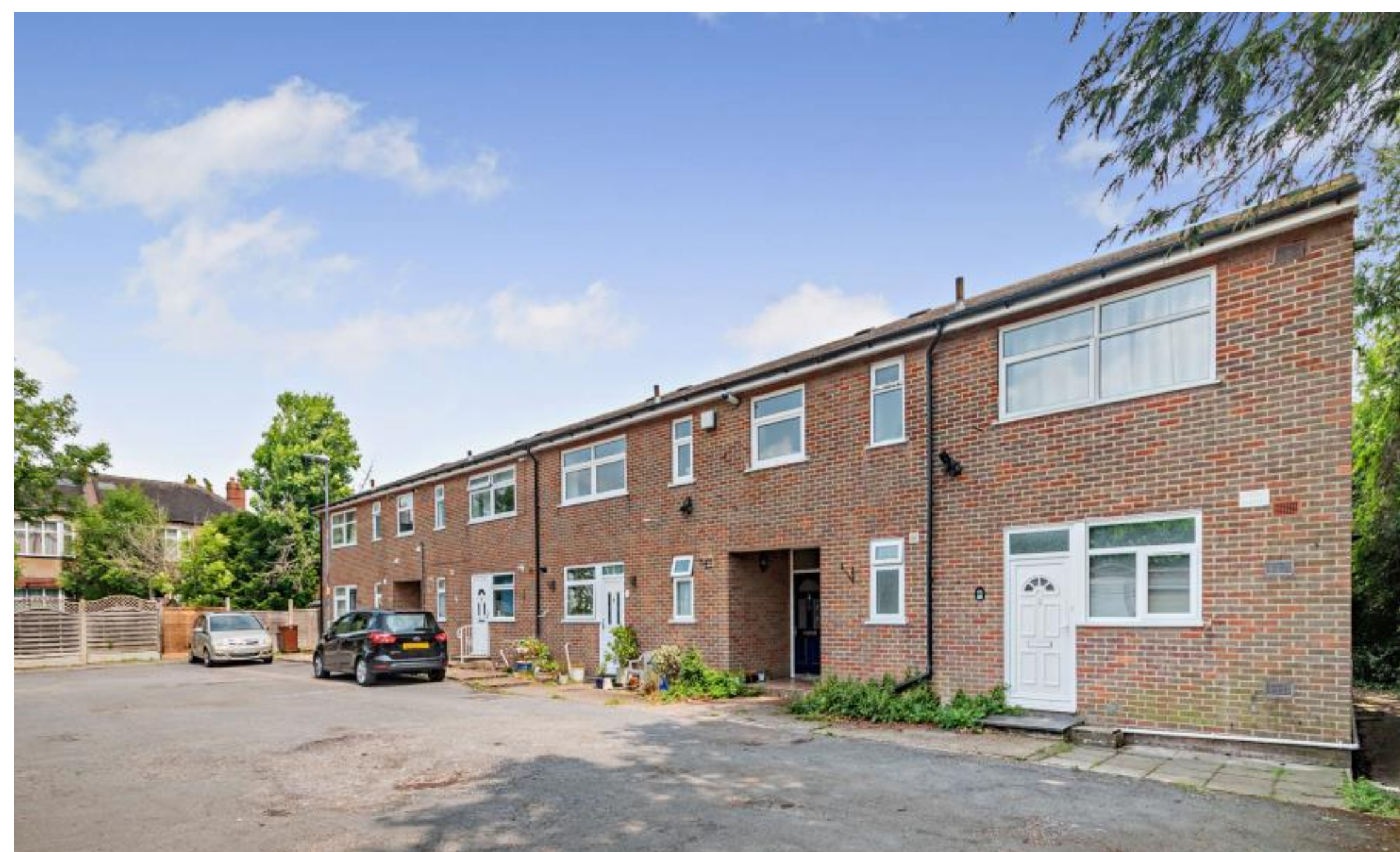
A two bedroom ground floor maisonette in sought after location West End Court,, HA5 1BP