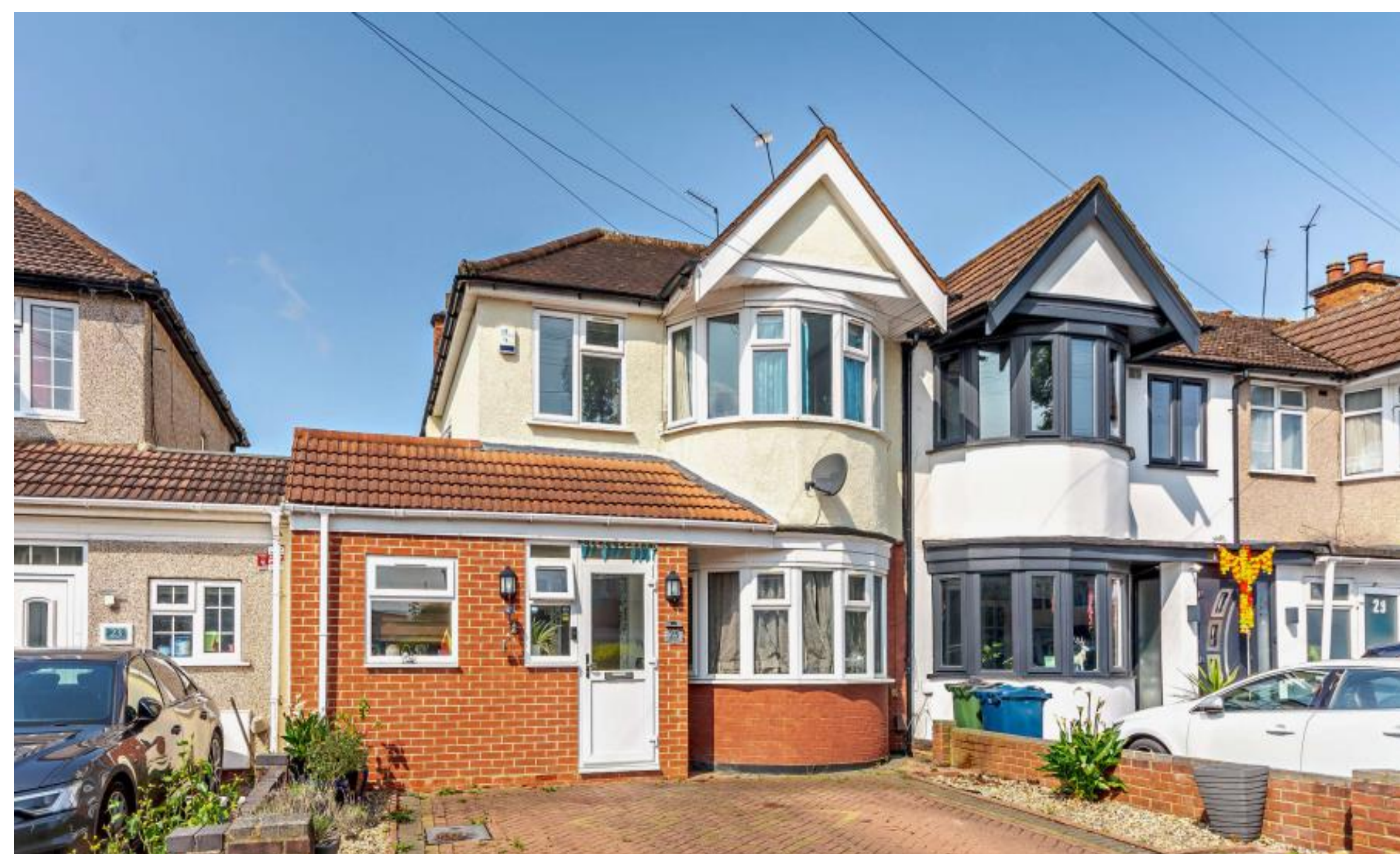
A four bedroom family home in a convenient location Ravenswood Court, Harrow, HA2 9JL