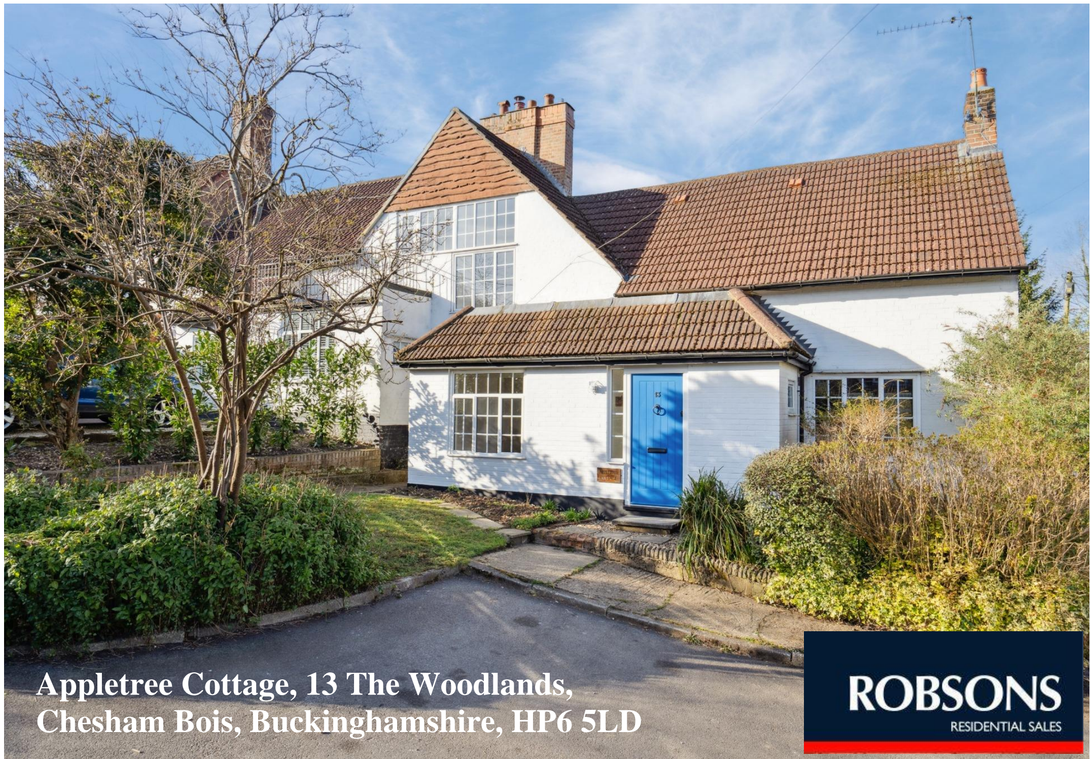
Appletree Cottage, 13 The Woodlands, Chesham Bois, Buckinghamshire, HP6 5LD