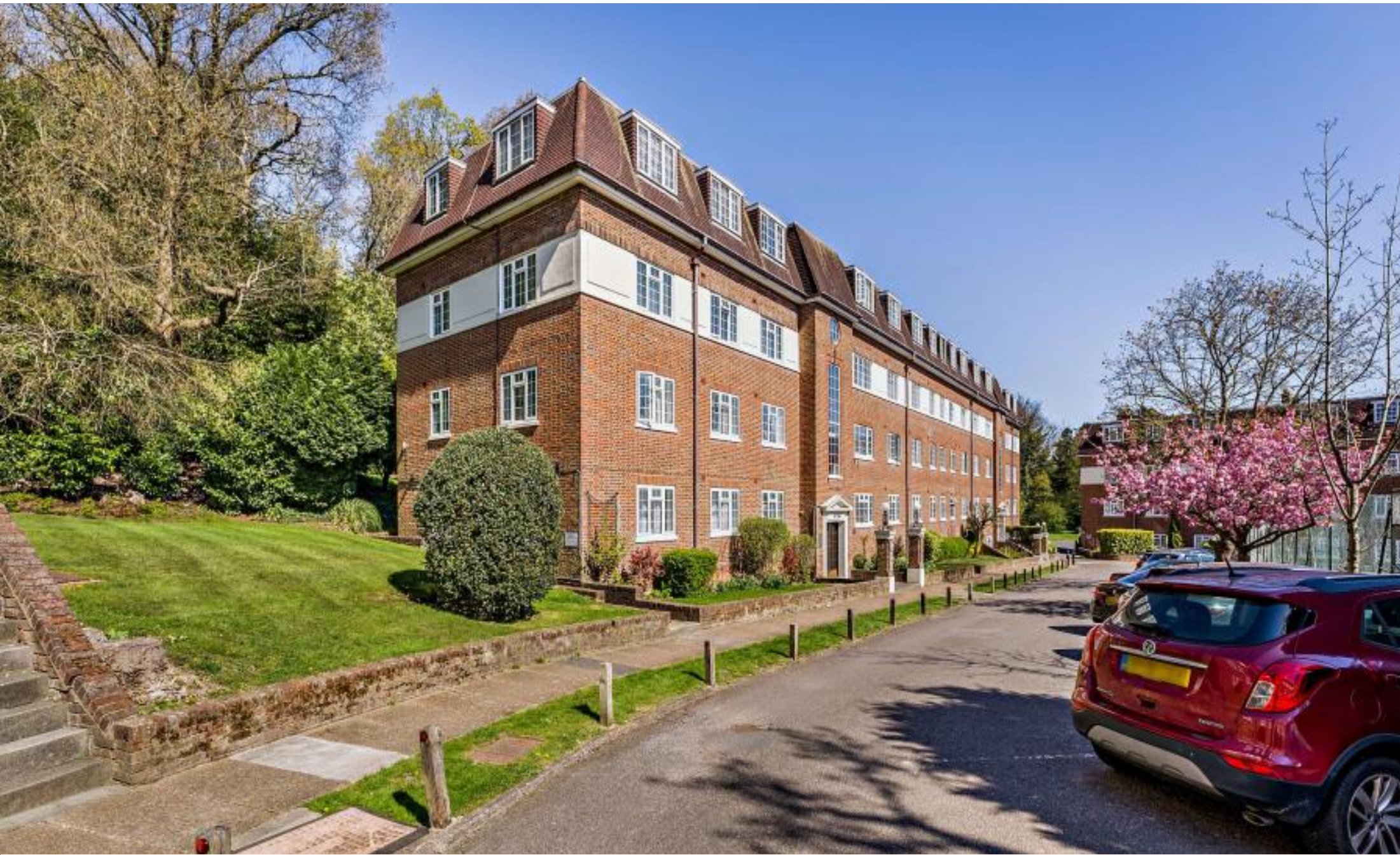
A newly refurbished studio apartment on Harrow on the Hill Herga Court, Harrow, HA1 3RS