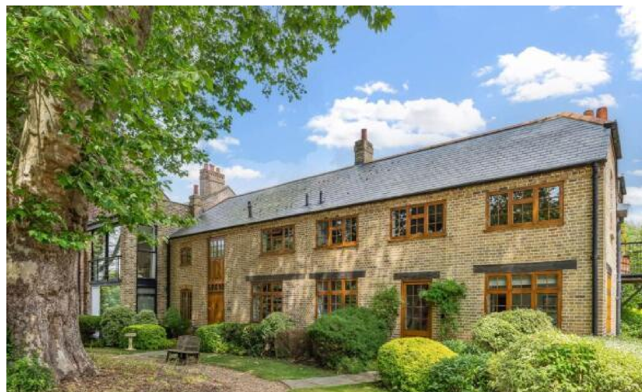
A four bedroom character property in a sought after location Old Mill Close, Uxbridge , UB8 2BS