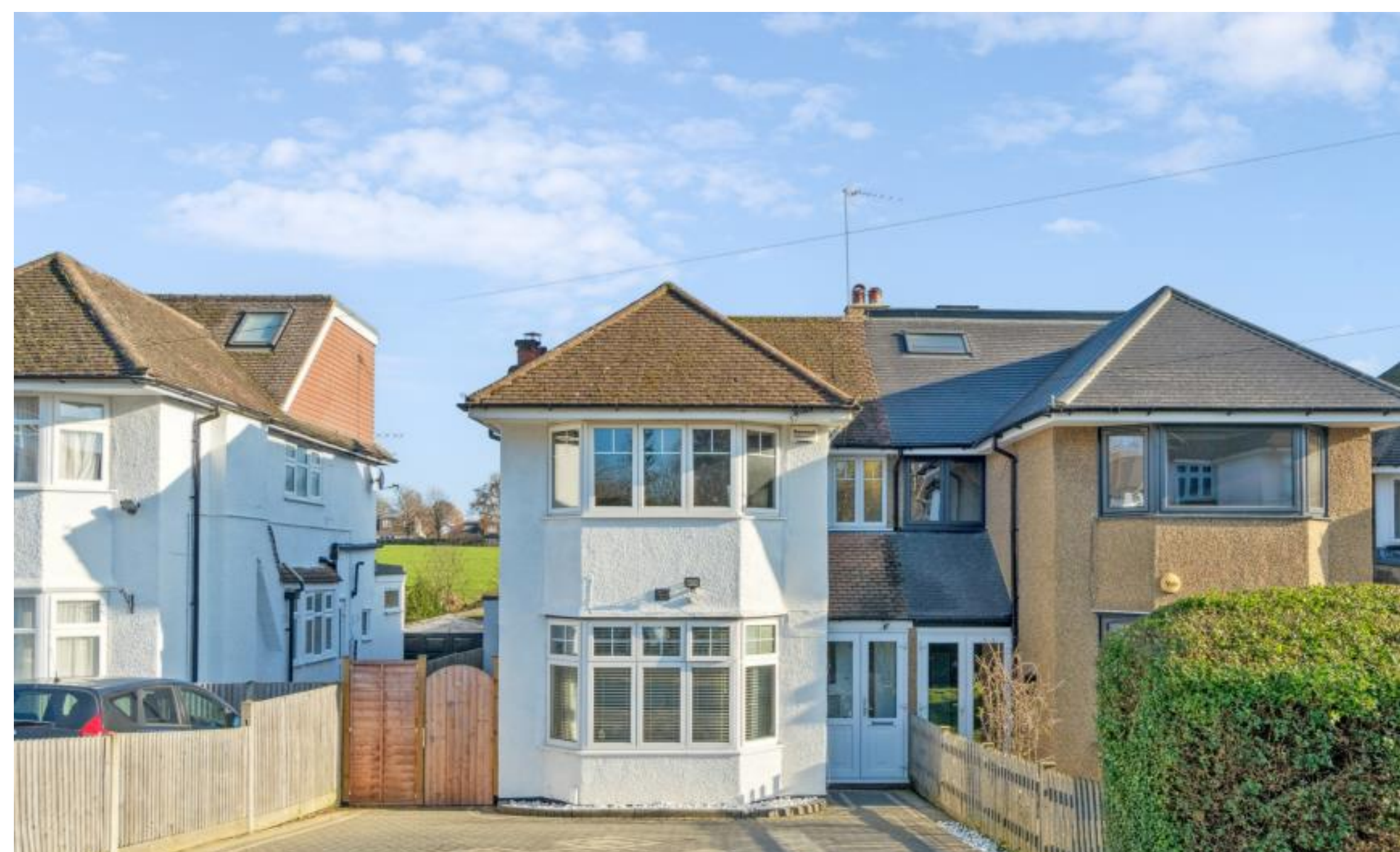
A three bedroom home in a sought after location Middleton Drive, Pinner, HA5 2PG