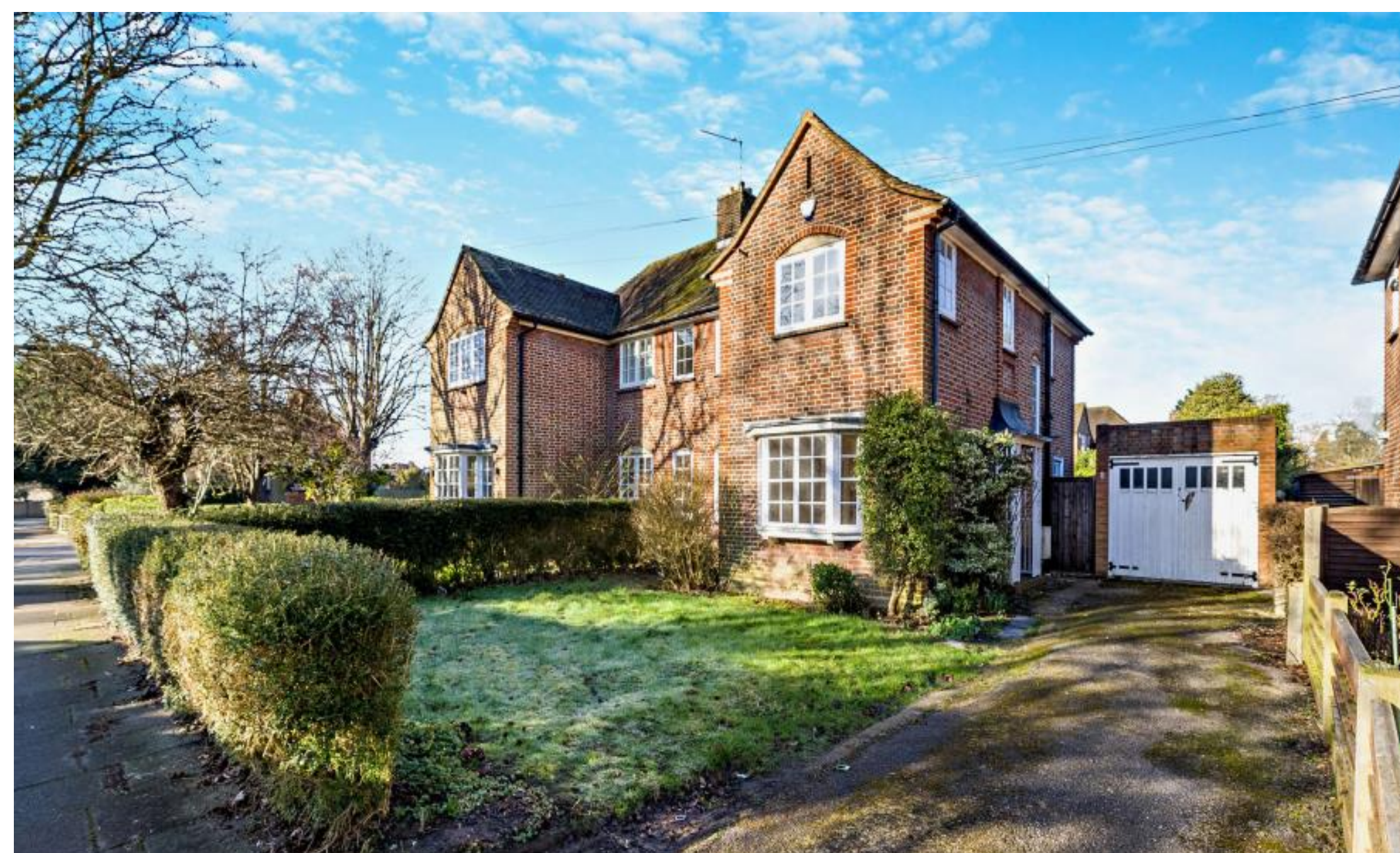
A three bedroom character home in a convenient location Hallam Gardens, Pinner, HA5 4PR