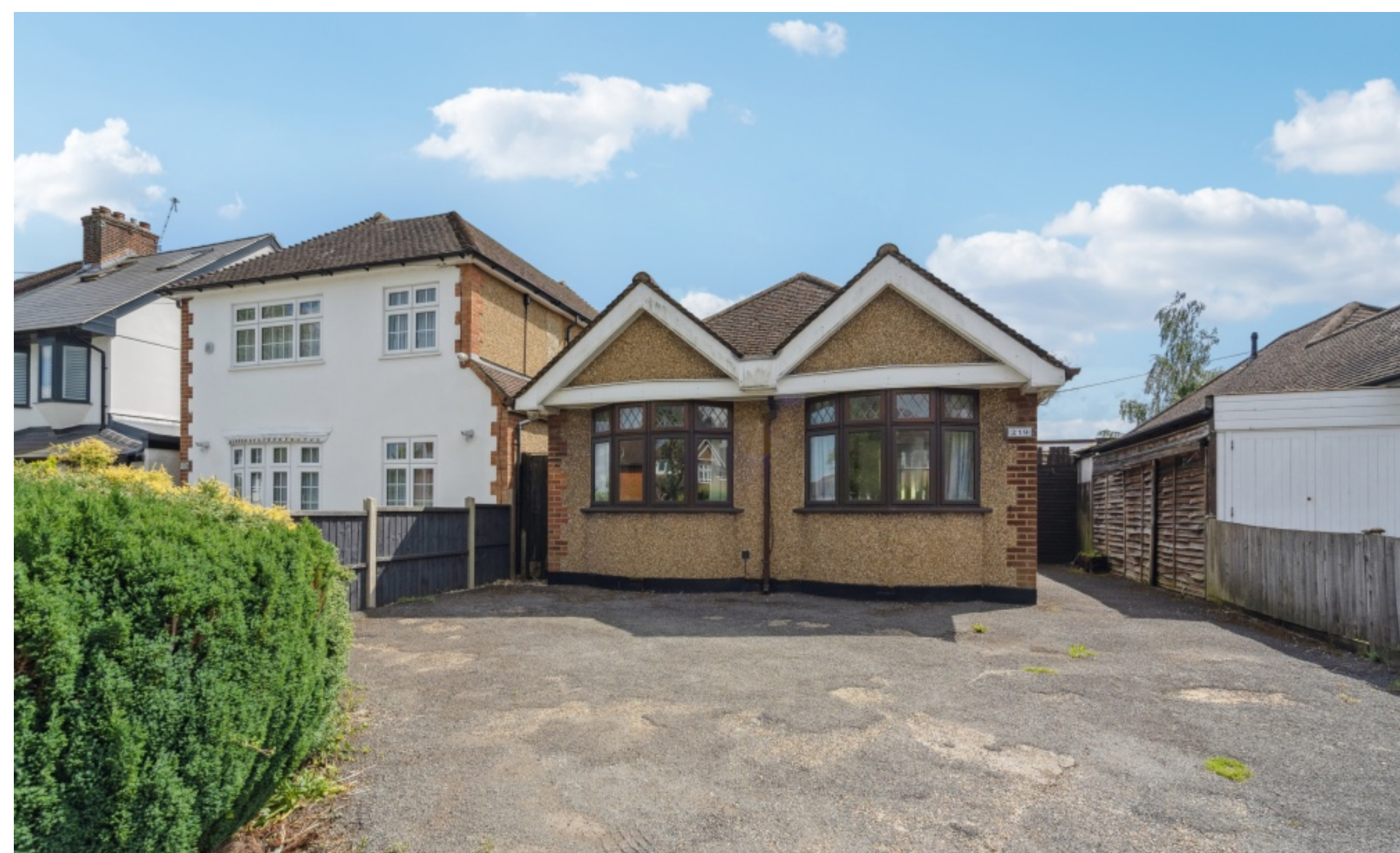
A three bedroom detached bungalow in a sought after location Baldwins Lane, Croxley Green, WD3 3LH