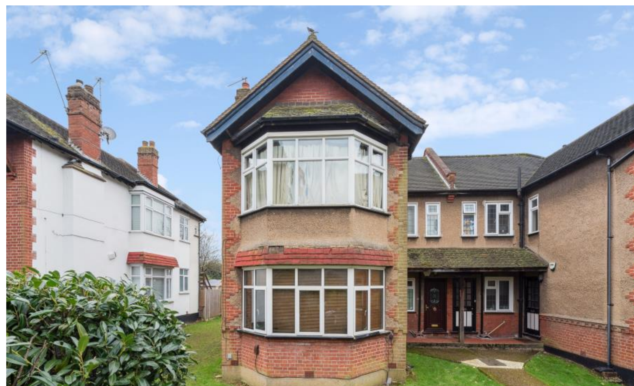
A two bedroom ground floor flat with a private rear garden West End Court, Pinner, HA5 1BP