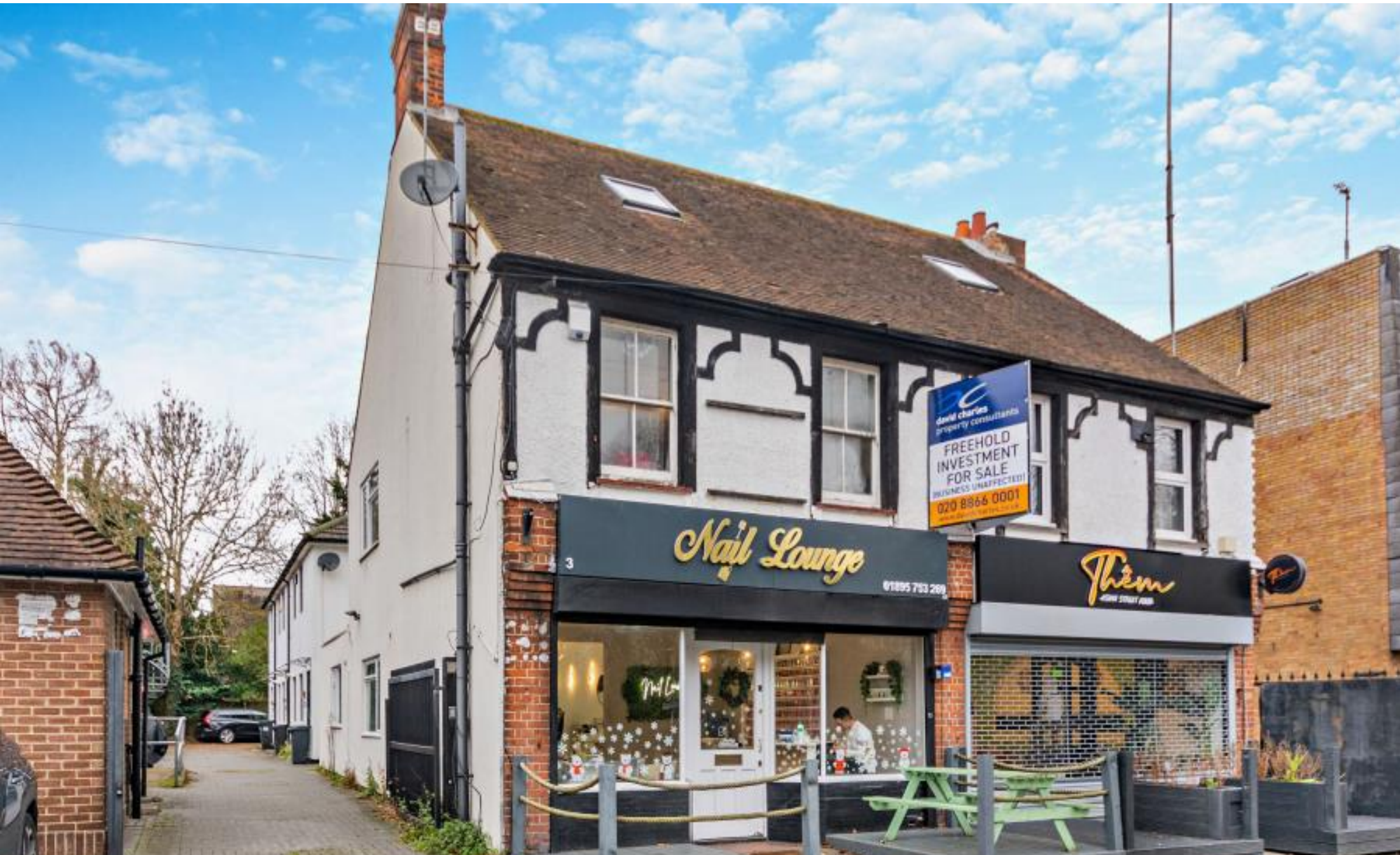
A second floor studio flat in a convenient location for local amenities High Road,Ickenham, UB10 8LE