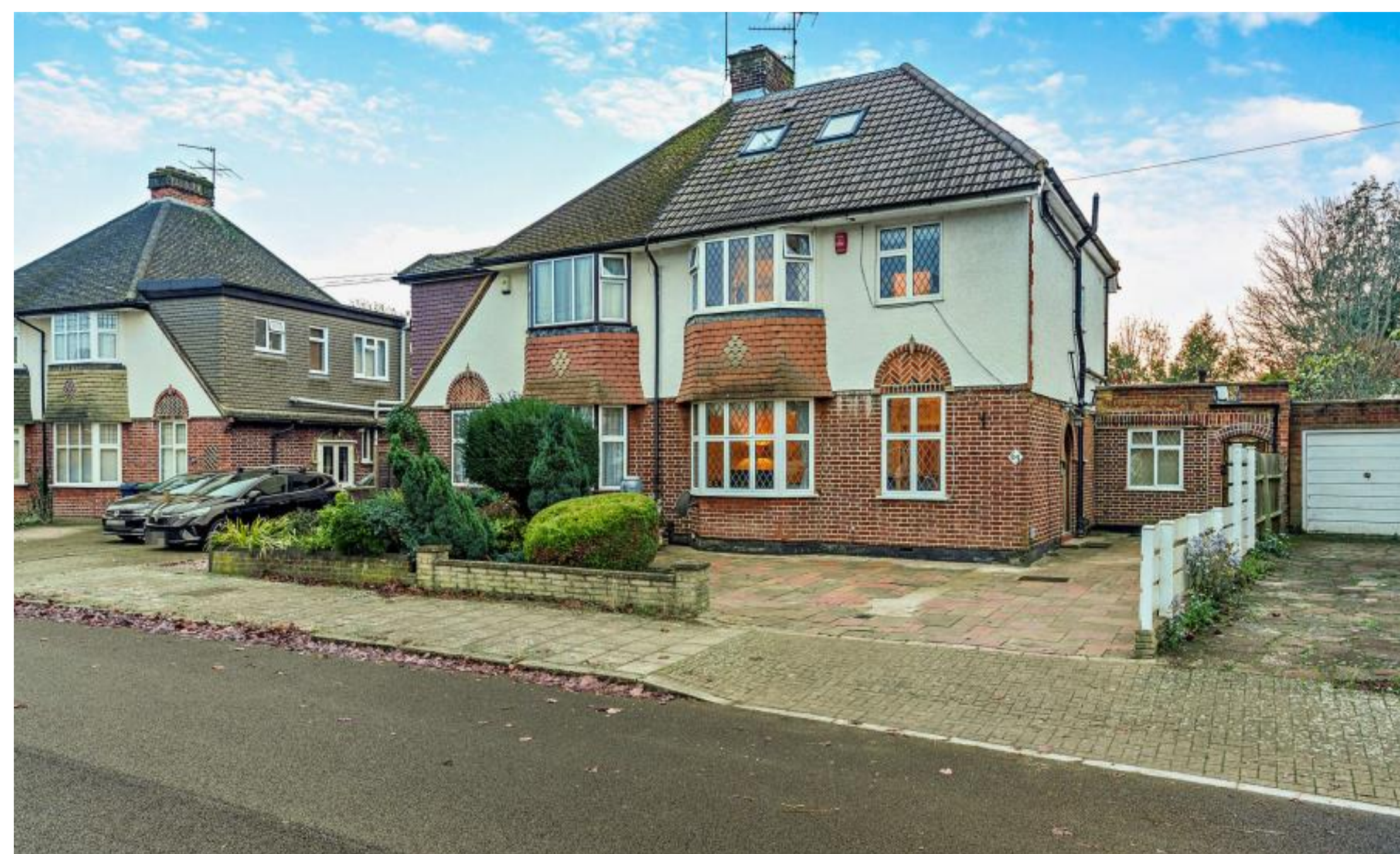
A four bedroom, four bathroom family home in a sought after location Hill Road, Pinner, HA5 1LD