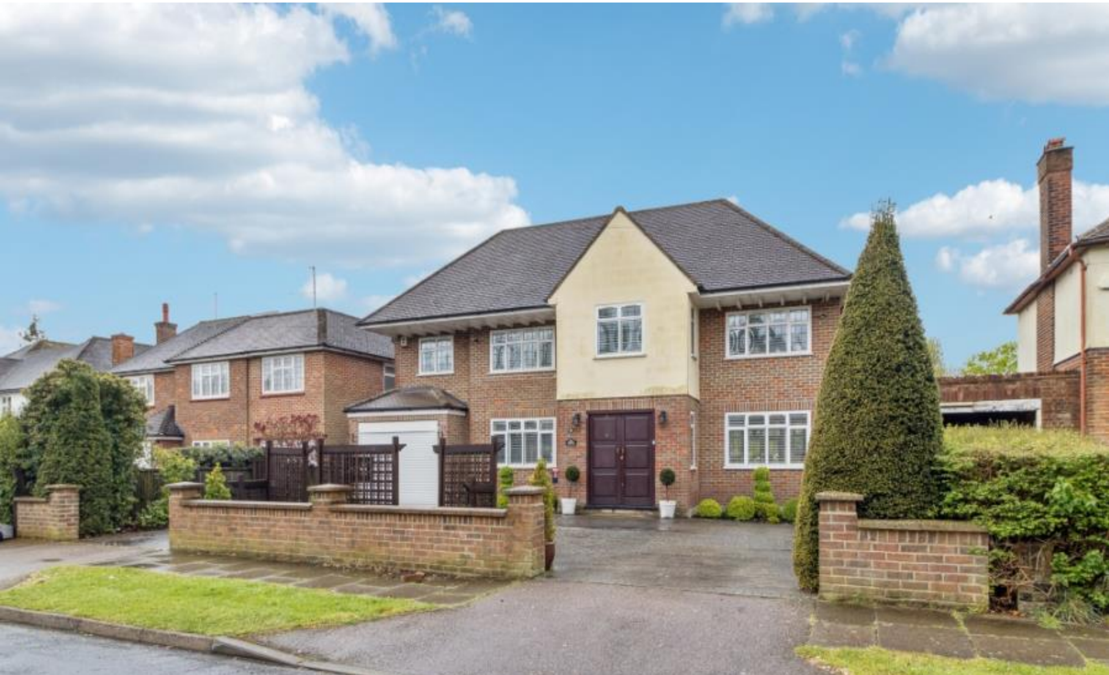
A 6/7 bedroom family home in a sought after location The Fairway, Northwood, HA6 3DZ