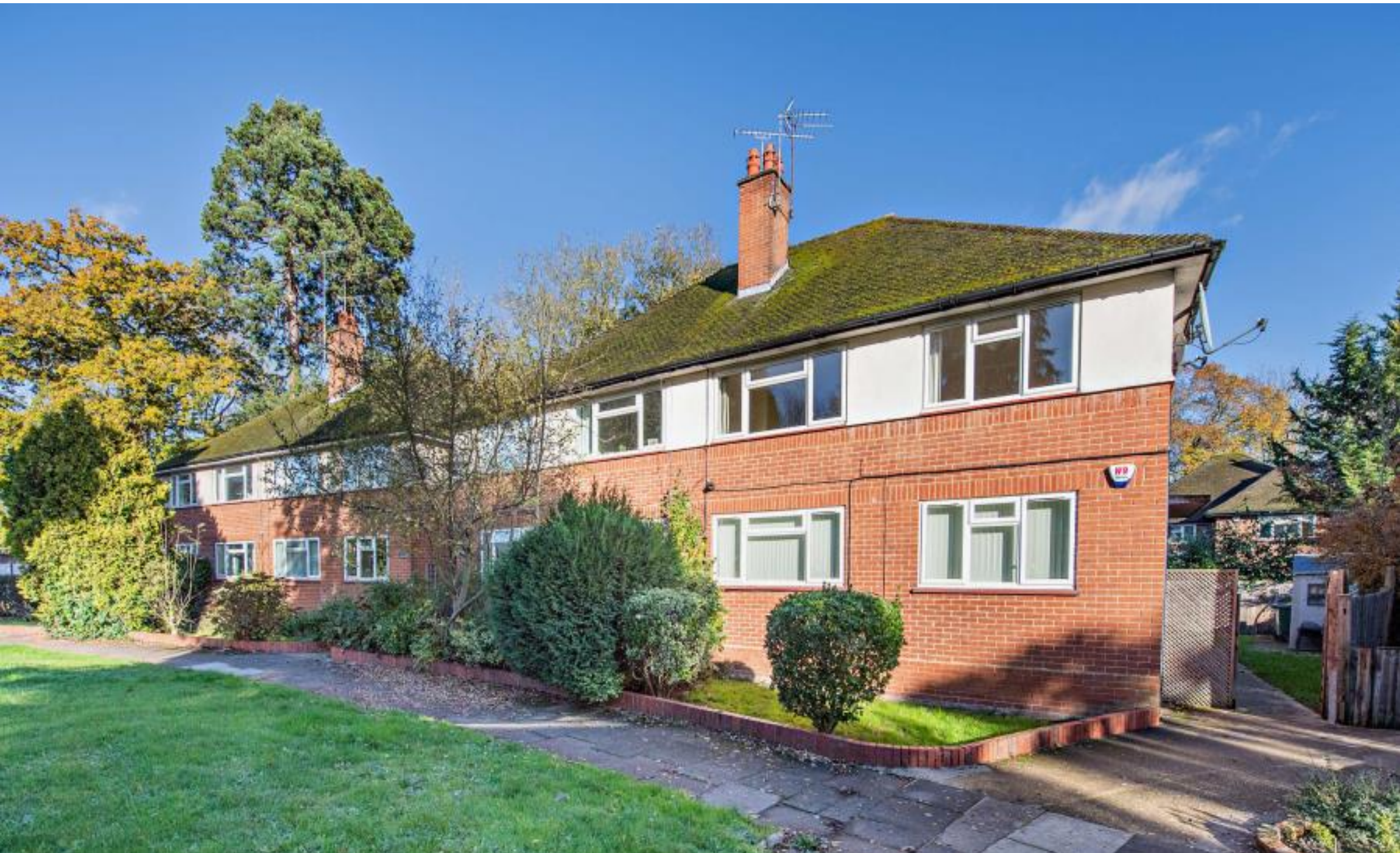
A two bedroom first floor maisonette with a share of the private rear garden Lloyd Court, Pinner, HA5 1EG