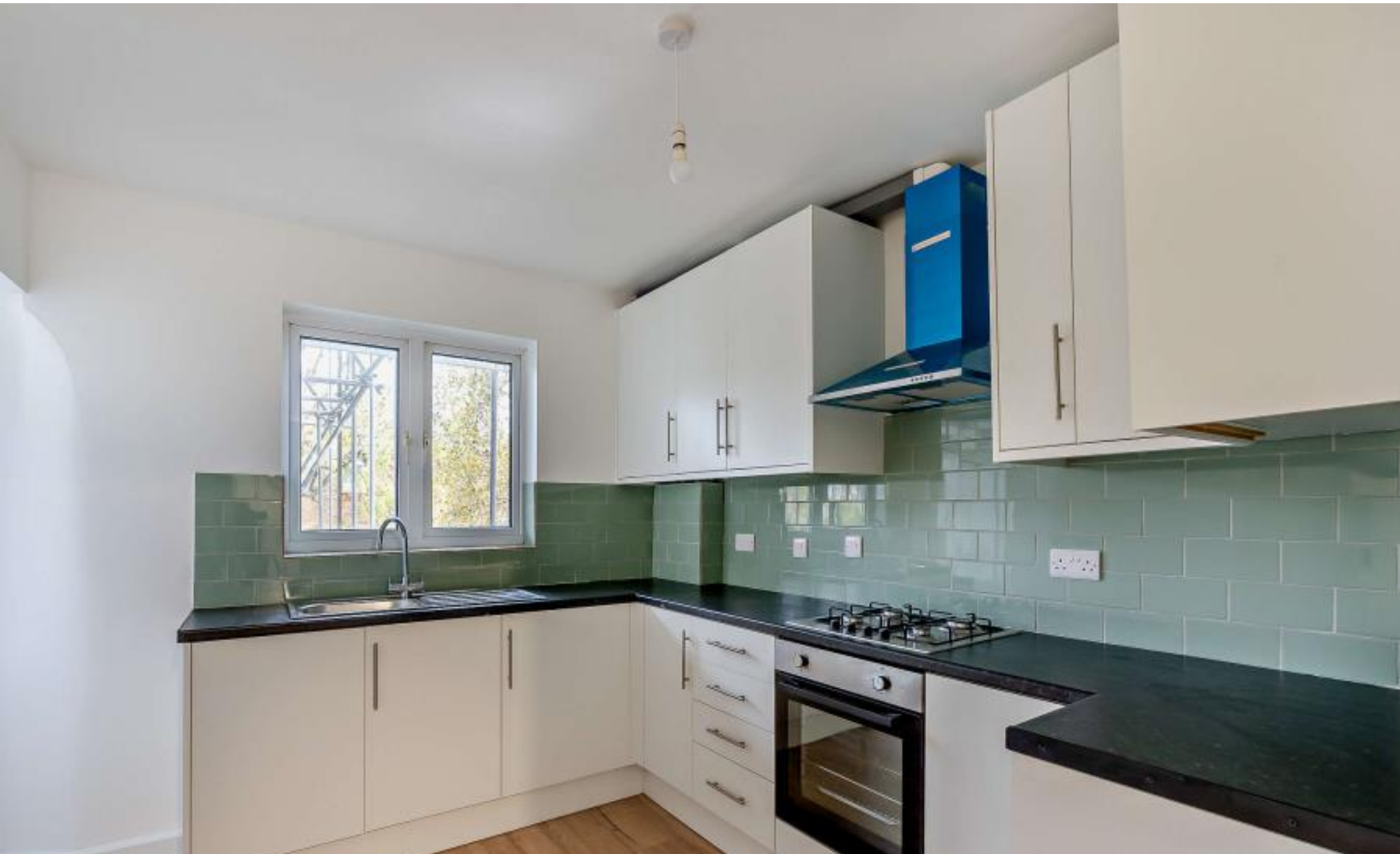
Two bedroom apartment conveniently located Northcote,Pinner, HA5 3TW