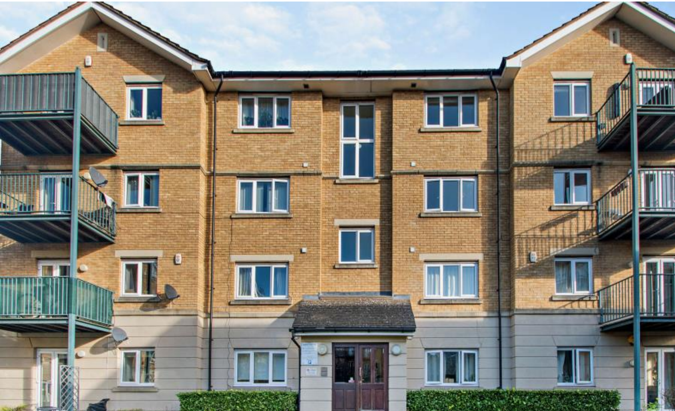
A three bedroom, two bathroom apartment in a gated development Fentiman Way, Harrow, HA2 8FD