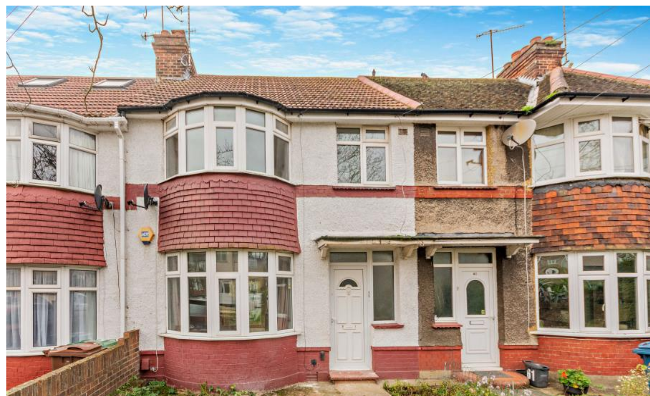
A newly refurbished three bedroom house with a large garden Abercorn Crescent, Harrow, HA2 0PX