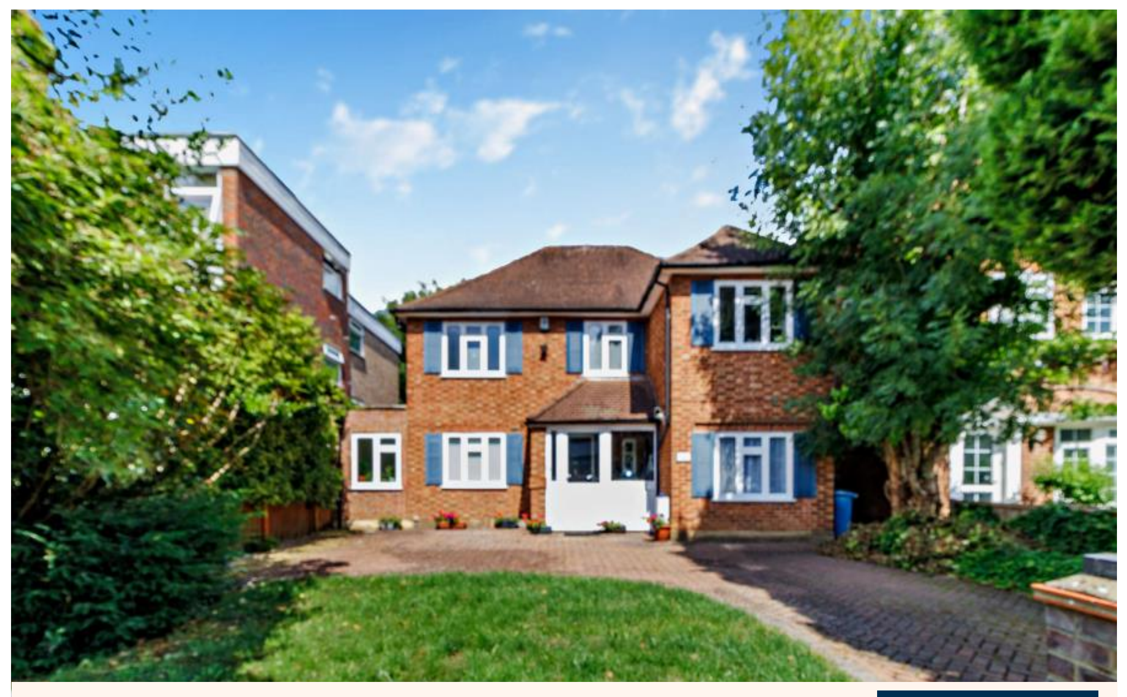
A four bedroom family home in a tree lined road Devonshire Road, Hatch End, HA5 4LZ