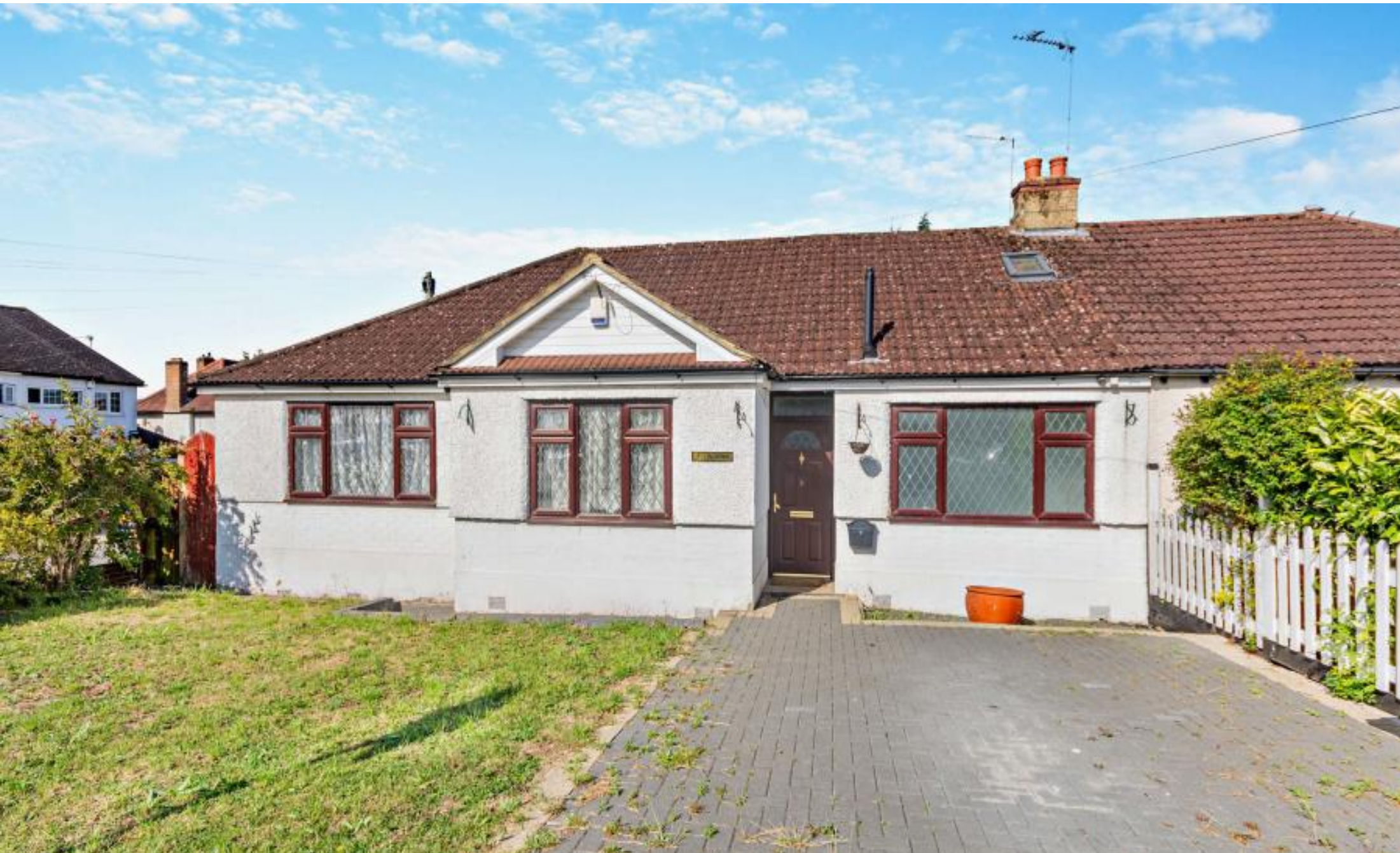
A refurbished three bedroom bungalow close to local amenities Lyndhurst Gardens, Pinner, HA5 3XD