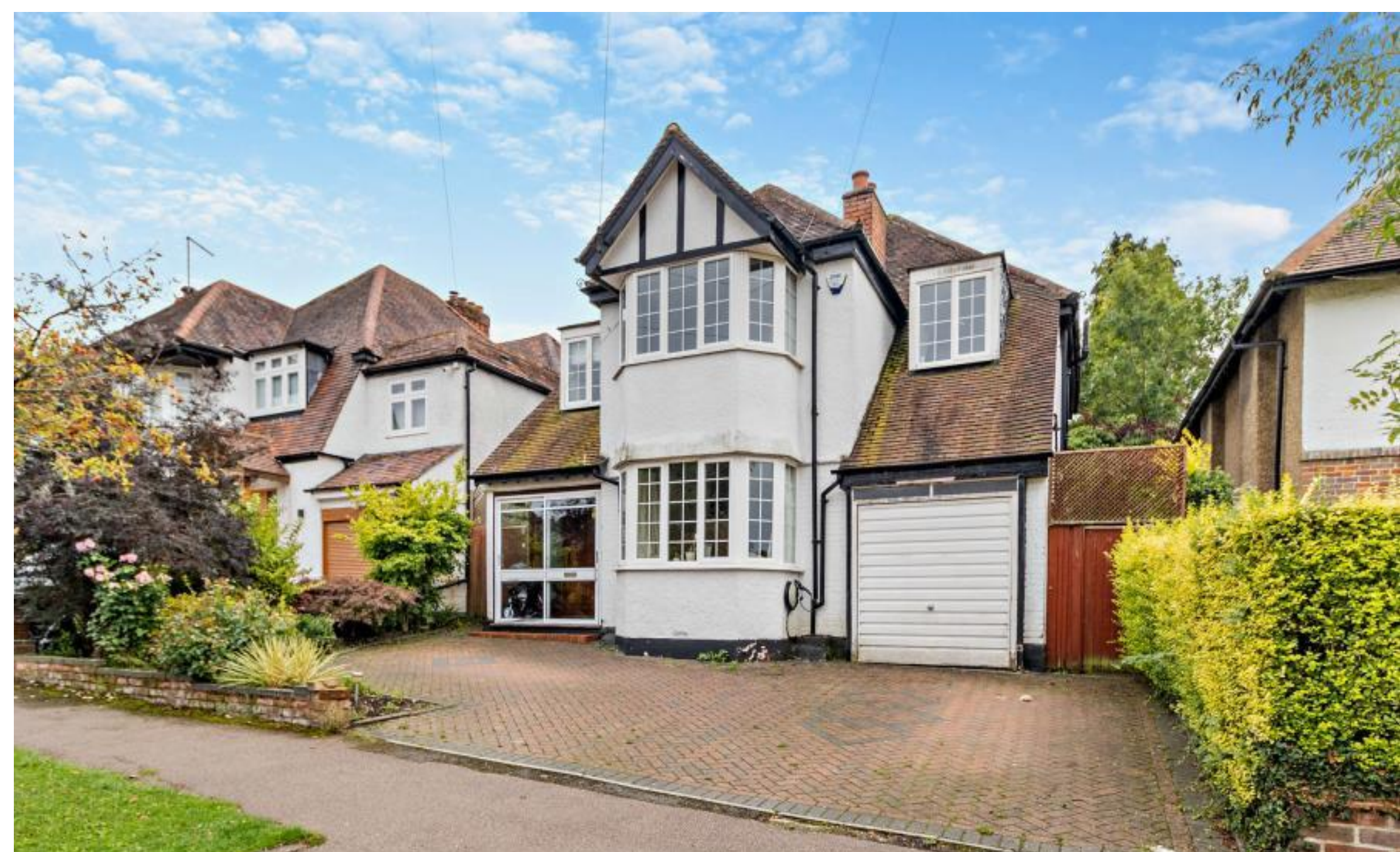
A four bedroom detached family home in a sought after location St Marys Avenue, Northwood, HA6 3AY