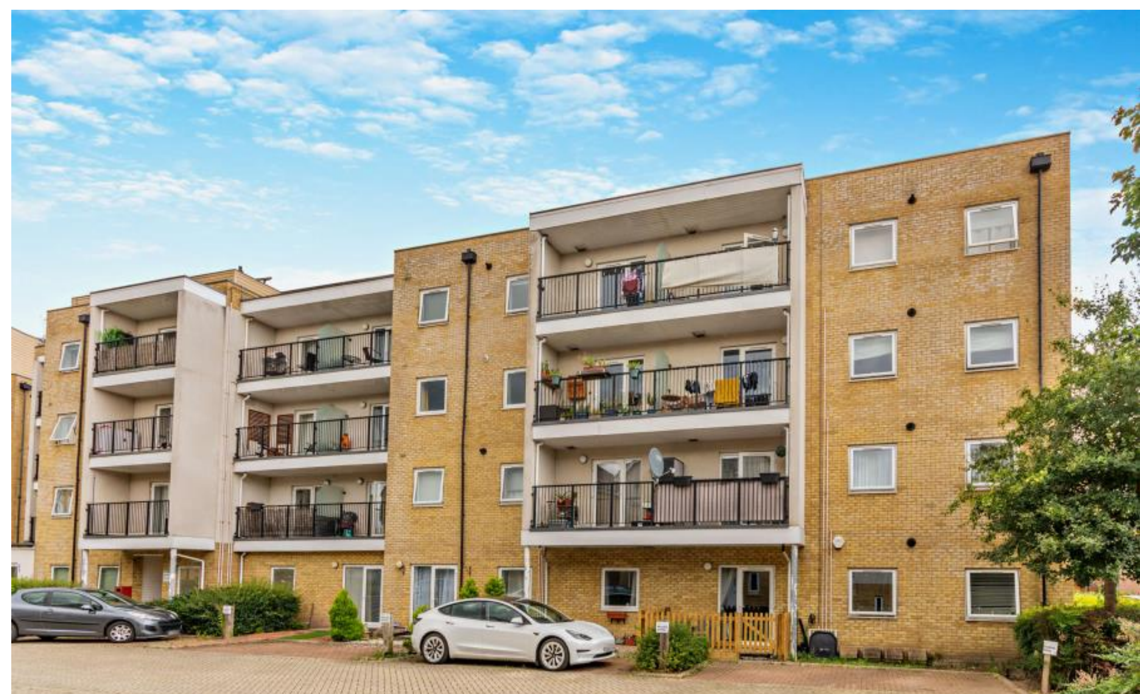
A two bedroom luxury apartment in a gated development Cochrane House, Ickenham, UB10 8FX