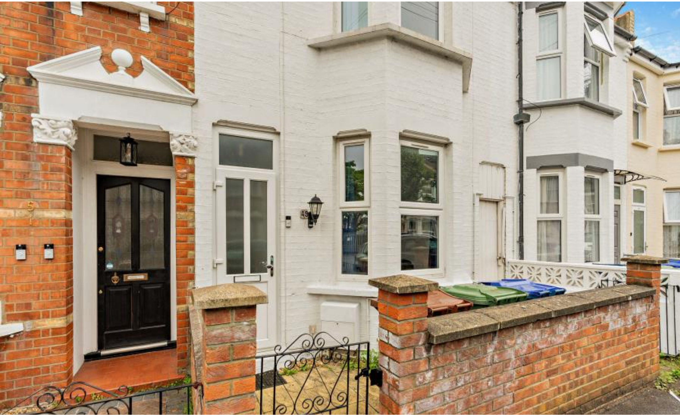
A four bedroom family home located in a convenient location for local amenities St Kildas Road, Harrow, HA1 1QD