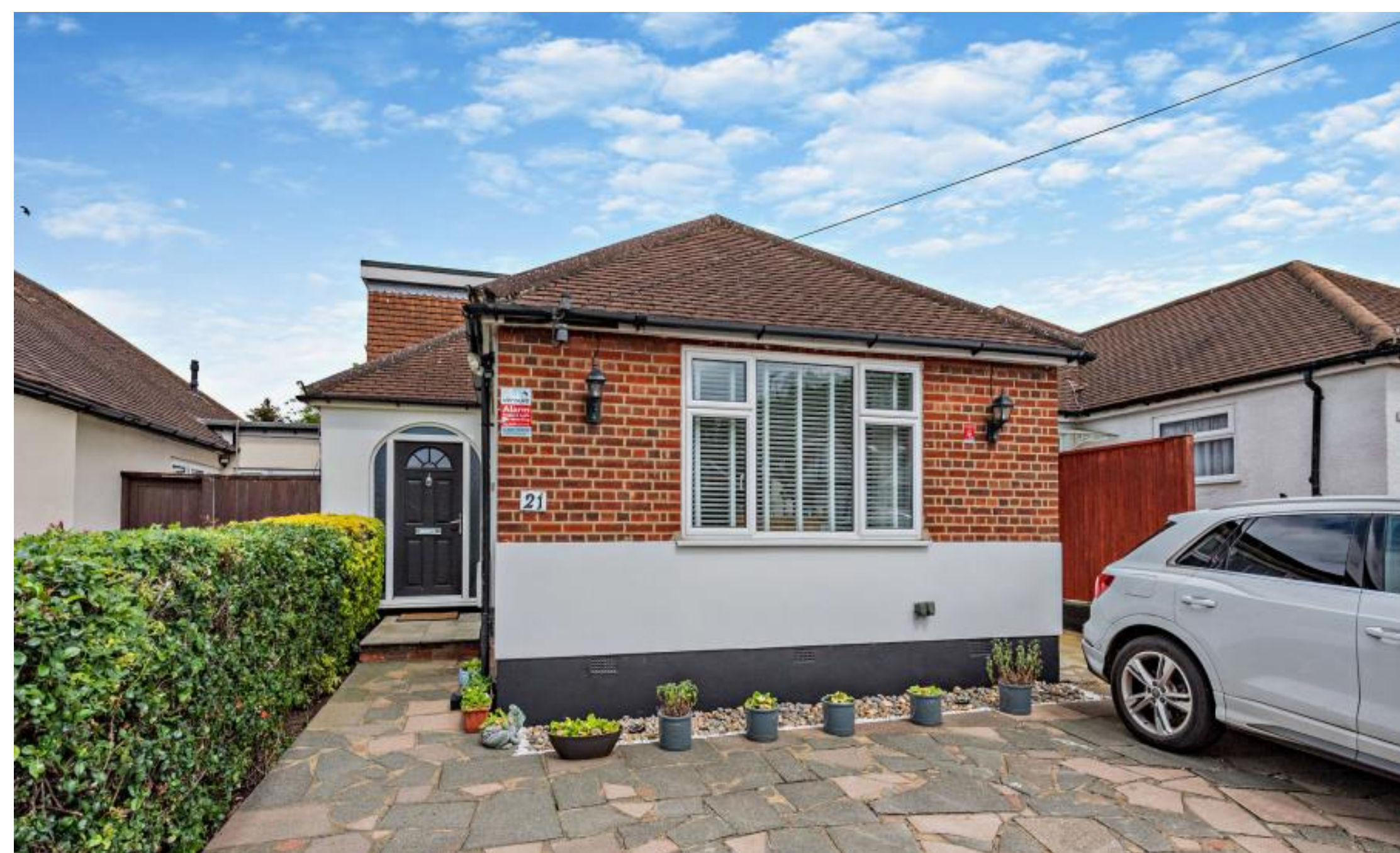
A four bedroom refurbished family home in a convenient location Woodford Crescent, Pinner, HA5 3TZ