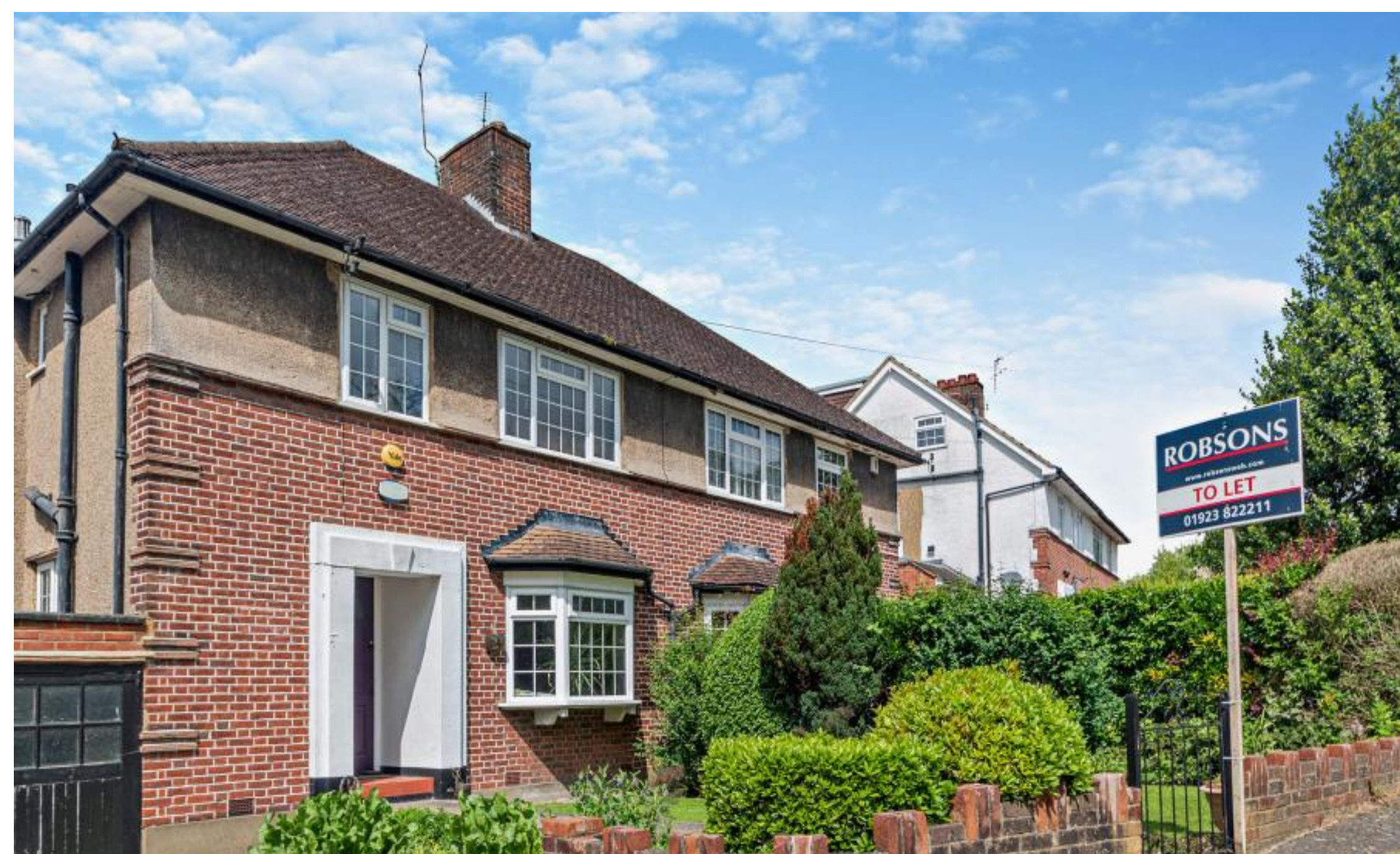
A three bedroom family home in a convenient location Northwood Way, Northwood, HA6 1RE