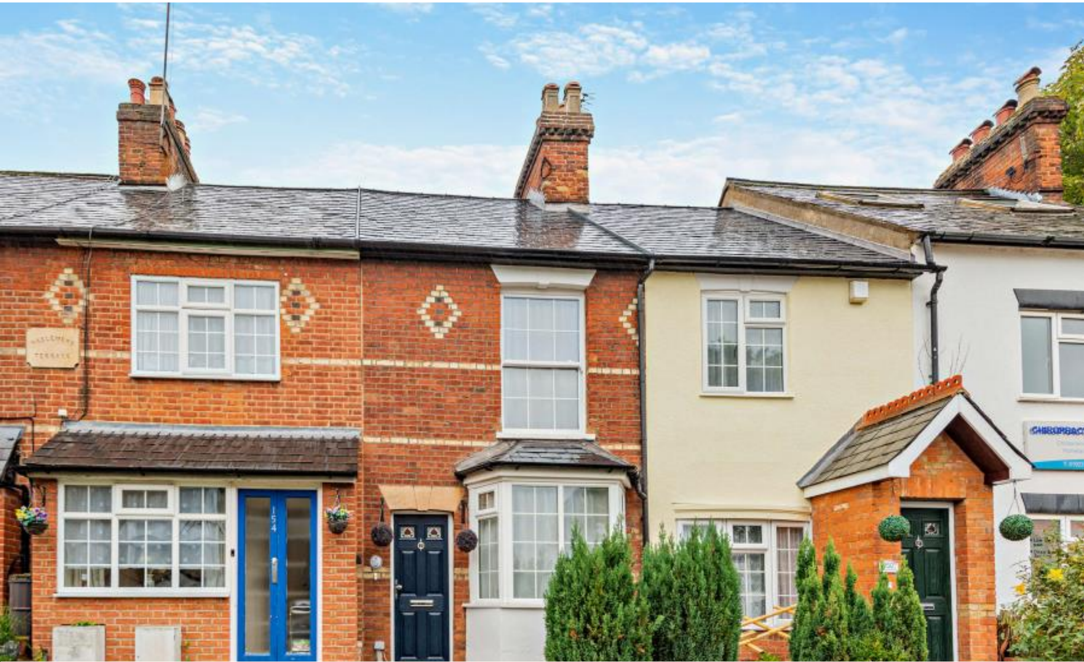
A two bedroom cottage in the heart of Rickmansworth High Street, Rickmansworth, WD3 1BA