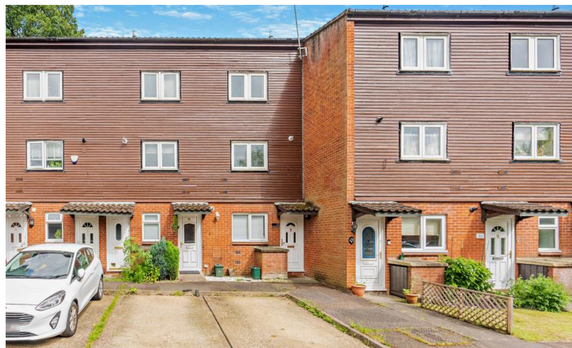
A one bedroom duplex maisonette with allocated parking space Myrtleside Close, Northwood, HA6 2XH