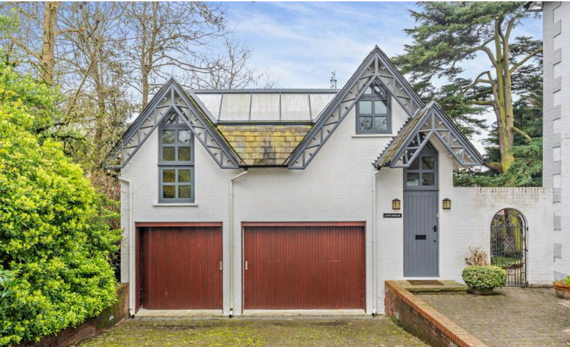
A beautifully presented one bedroom maisonette Church Lane, Pinner, Middlesex HA5 3AB