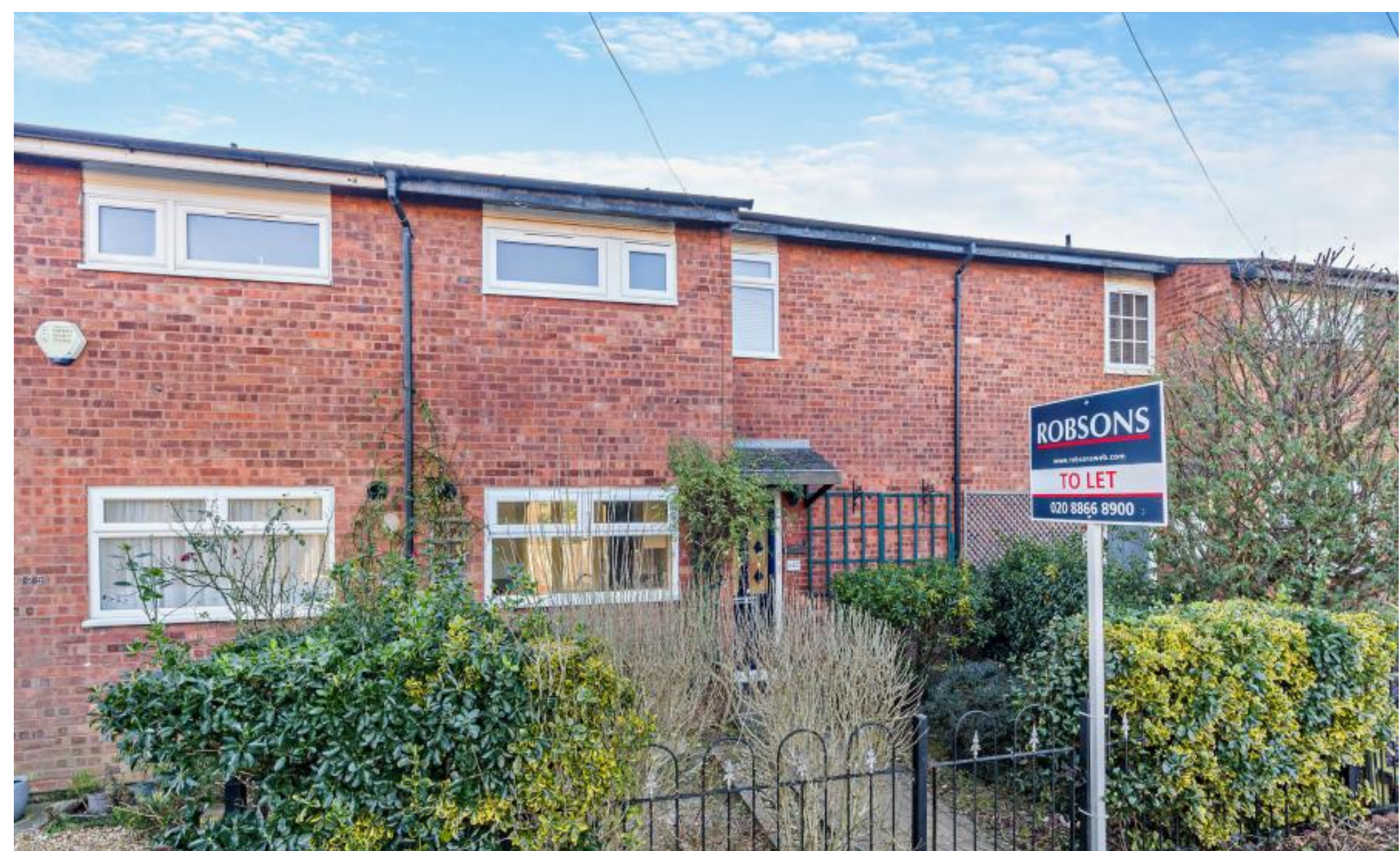
A charming two double bedroom family home in a popular location Wiltshire Lane, Eastcote, HA5 2NA