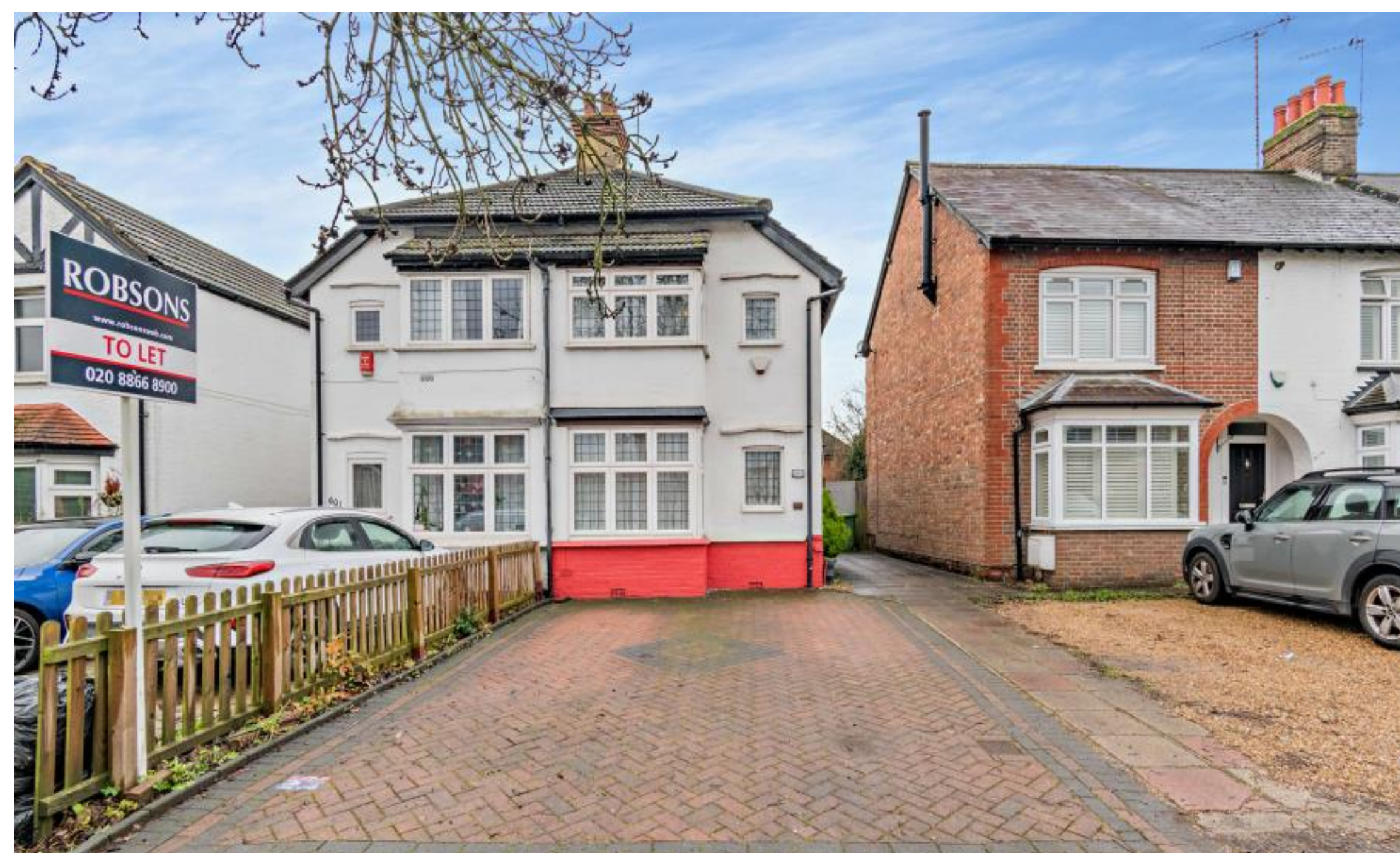
A three bedroom family home in a convenient location Pinner Road, Pinner, HA5 5RT