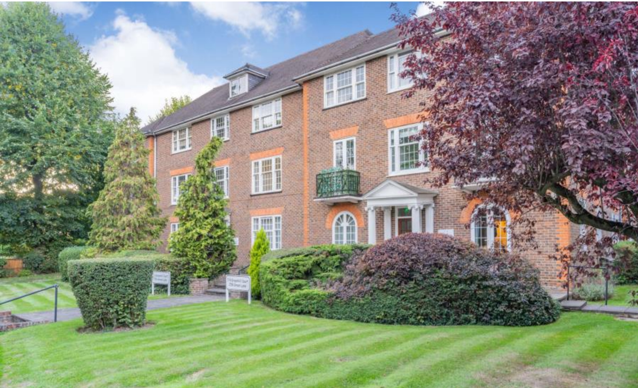
A two bedroom, two bathroom town centre flat Green Lane, Northwood, HA6 2XJ