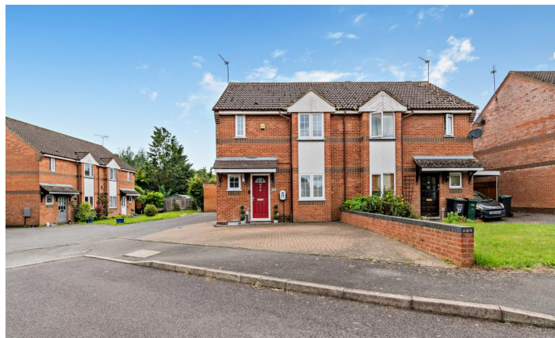
A beautifully modernised semi detached family home in Rickmansworth Oakhill Road, Maple Cross, WD3 9RE